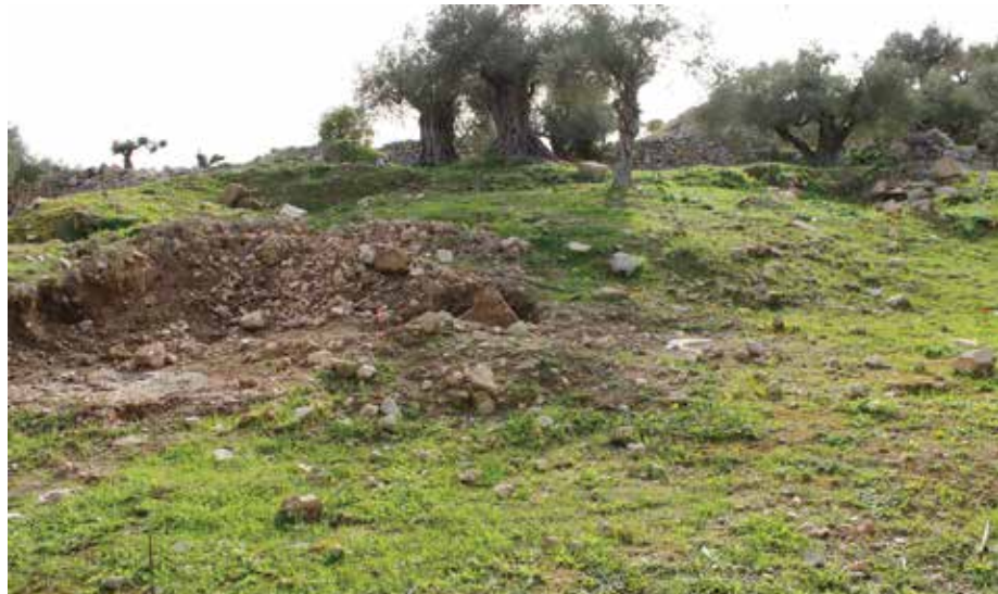
Figure 1. A cut made by a bulldozer in the Byzantine-era church of Khirbet el-Lauz, looking south, 2018.

The results of that initial research project were fourfold: (1) According to the interviewed looters, at least eighty-nine features of different periods had already been vandalized, including the Roman and Byzantine rock-cut tombs, Roman-period ritual baths, a Roman-Byzantine columbarium, cisterns of the Roman through Early Islamic periods, Byzantine-era olive- and winepresses, residential structures of various periods, and the Byzantine church. (2) Our field survey indicated that about 75 percent of the total area of the ancient settlement had been damaged down to the bedrock, sometimes using heavy, mechanized equipment. (3) Our detailed excavation of the four plundered features indicated that the looters working on these spots were professionals, since they left behind nothing except the sherds of nonrestorable ceramic vessels (Al-Houdalieh 2008, 2009). (4) In subsequent years, the residents of Saffa Village—especially the local council, youth leaders, and teachers from three different local schools—have independently organized visits to the khirbet for their members, students, supporters, and guests.