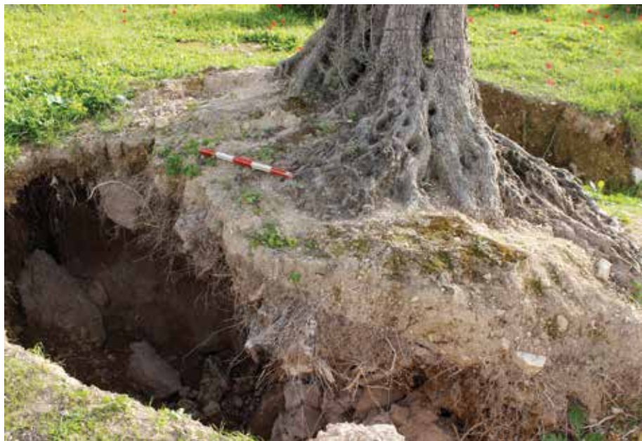
Figure 6. Looting pit at Khirbet el-Lauz, looking southwest, 2018.

was most pleased to do (fig. 9). Most important of all, of course, is that an entire class of Palestinian youth now possess a true sense of ownership over Khirbet el-Lauz, and hopefully other places like it.