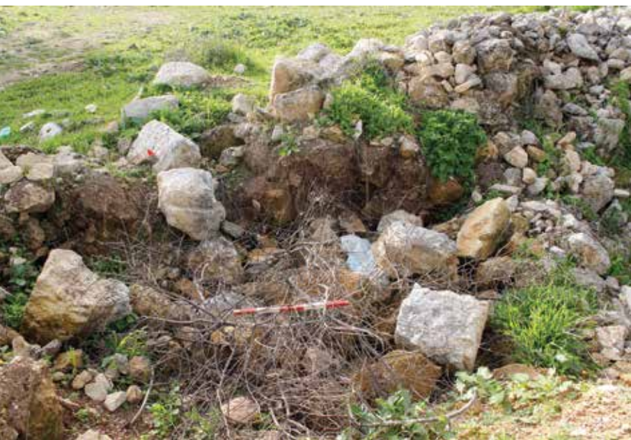
Figure 4. Looting pit at the southwestern corner of the Byzantine-era church of Khirbet el-Lauz, looking south, 2018.

located just west of the church was found almost full with large plastic bags of rotting garbage. Continuing our walk toward the summit of the khirbet , we noticed an increasing number of freshly dug holes and trenches of different sizes and depths, and heaps of dirt and discarded pottery sherds. Based on the lack of the usual seasonal growth of plants around these disturbed areas, we knew that all this destruction had just been carried out in the preceding two months, during the winter of 2017–2018.