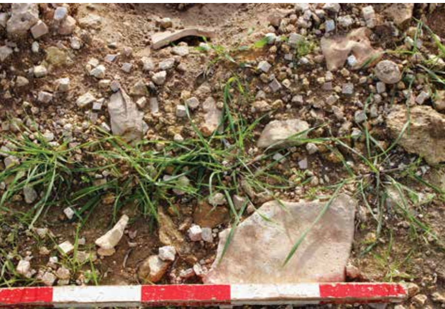
Figure 3. Cubes of recently destroyed mosaic pavement of the Byzantine-era church of Khirbet el-Lauz, looking south, 2018.