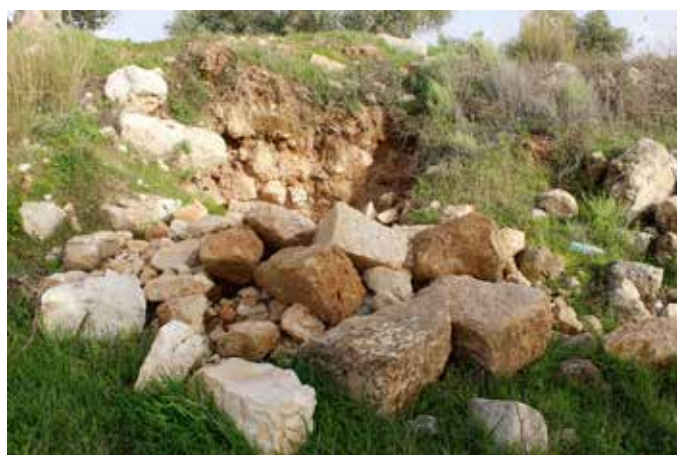
Figure 8. Destruction of the remains of the fortification system at Khirbet el-Lauz (compare with fig. 7), looking east, 2018.

society organizations and the general public can be of great help towards preserving these special places.