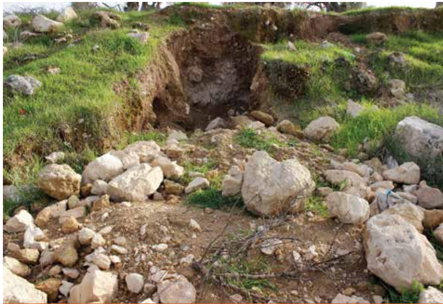
Figure 5. Looting trench at Khirbet el-Lauz, looking south, 2018. Photograph by the author.

That was February, 2018. Taking up the challenge, the girls proceeded to fashion their report—informed by their own firsthand experiences on the site—and submitted it for evaluation at the beginning of April. Then on 15 May the Ministry announced the results: the report of Saffa School received an “A” and won the competition! A few days later, the director of Saffa School invited me to come and celebrate this achievement with them, which I