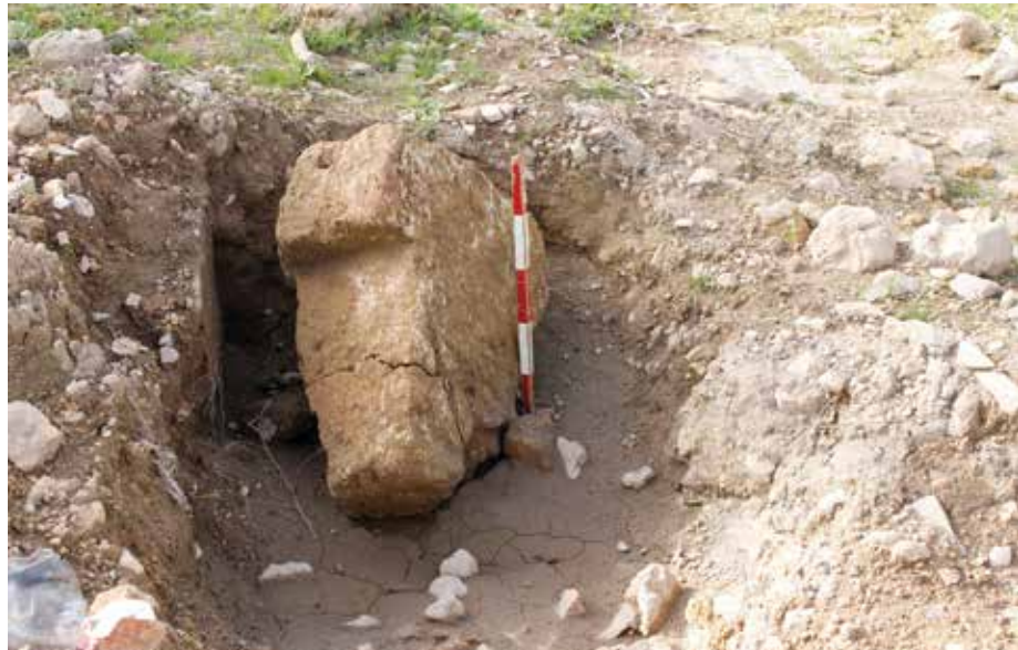
Figure 2. Destruction of the walls of the Byzantine-era church of Khirbet el-Lauz, looking west, 2018.

In the years since 2007, I made it a point to visit the site at least annually, and during all that time I noticed no dramatic changes—no new holes indicating resumed antiquities looting or other destructive activities. Then in February 2018, I organized and conducted a site visit for a number of students from the Saffa Secondary Girls School, with the aim of educating them about the ancient history of their village, using Khirbet el-Lauz as an example. But as we approached the eastern boundary of the site, where the Byzantine church is located, I immediately recognized that the site had recently been revisited by looters and once again badly damaged. The then-unknown perpetrators had obviously used a bulldozer to demolish the external walls of the church, plow a wide trench through the church's protective back-fill, and cut into the previously conserved mosaic pavements. They had also used more traditional equipment (hand tools) to dig holes within and around the church complex (figs. 1–4). The area was left in near-total destruction, and the cistern