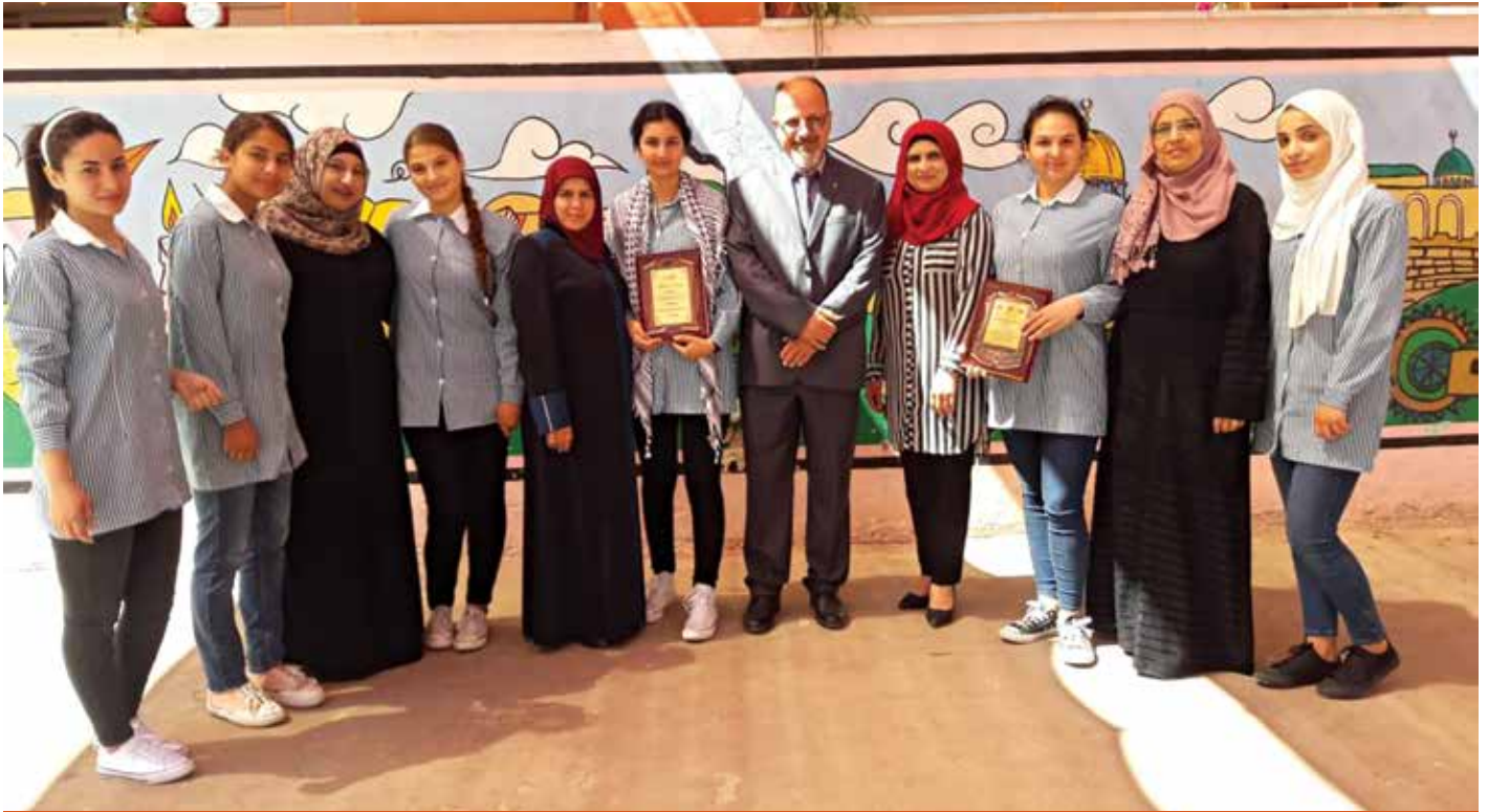
Figure 9. The the team of the school's report, with the author in the middle and the director of the Saffa Secondary Girls School to his left.

of the village residents as to the importance of this and other nearby archaeological sites. Furthermore, such organized visits to the khirbet hopefully signal to would-be looters that the site is being monitored by local residents. Indeed, considering the site's history of recurrent looting, it is quite possible that this kind of citizen presence helped prevent potential vandals from attacking el-Lauz for as long as ten years! That it failed in the end to protect it absolutely is, to us, simply a call to increased vigilance.