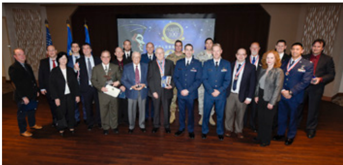
AFIT award winners at the centennial banquet awards ceremony.