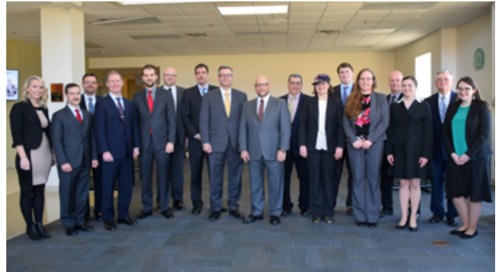
AFIT's Scientific Test & Analysis Techniques Center of Excellence team.

Over 800 test points were collected, each at 200 KHz, demonstrating the usefulness of design of experiments for wind tunnel testing. On-site test support was also provided which allowed for efficient test matrix adjustments and real-time data analysis.