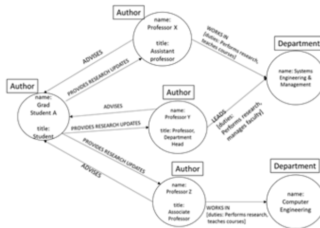
Figure 2. Example of a property graph model using authors and their relationships.

Graph models are considered to represent relationships more naturally than other data models. Graphs can overcome the impedance mismatch commonly found in relational models of data objects. The object-relational impedance mismatch describes the difference between the logical data model and the tabular-based relational model resulting in relational databases. This mismatch has long created confusion between technical and business domains [1] [16].