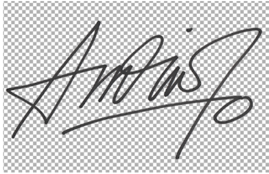
Fig. 2. Background elimination