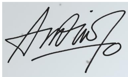
Fig. 1. Scanning process

Noise is dots on the image which are not a part of the image, but also in the image for a reason [10]. Noise is something undesirable, regarded as the cause of the lack of detail of the signature object. Therefore, noise reduction used to eliminate objects that are outside the signature area thus making the object or image detail becomes better. The result of the noise reduction process shown in Fig. 3. In image processing, normalization is a process that converts the pixel intensity range. Length and width dimensions of an object image are different. In this stage, the length and width of an object have to be recognized. In this stage, width normalization process was done by cutting the space between the edges of the image with the image object using Adobe Photoshop software. The outcome of this process is shown in Fig 4.