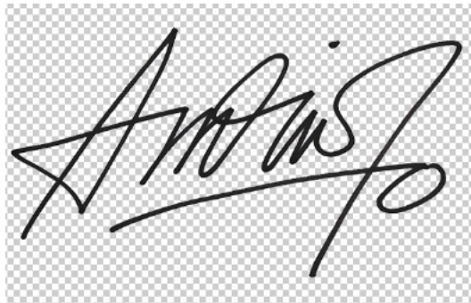
Fig. 3. The result of noise reduction process

Image processing is done to improve the image quality to be easily interpreted by a human or a computer for certain purposes, which in this study image processing used for the signature recognition. Hence, SOM Kohonen method implemented for image processing in the form of a signature. SOM Kohonen method requires some featured values that are extracted from the image.