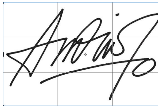
Fig. 5. Example of signature grid feature