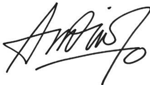
Fig. 4. The result of width normalization process

Fig. 5 is an example of a grid feature process result. In this discussion will look for the appropriate composition of the grid distribution. In general, the more the grid distribution, the greater the accuracy level, but requires memory and computation time that is greater. Therefore, it is needed to be done the grid testing of 3x3, 3x4 or 5x5. The experimental results are presented in Table 1.