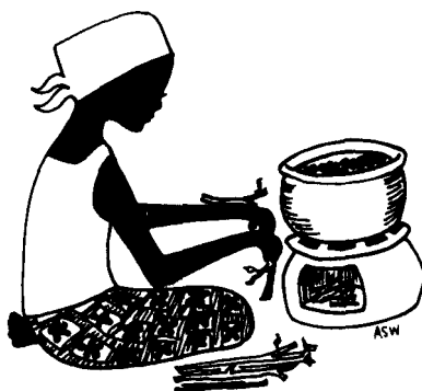
Reprinted with permission from the IWTC. Artist: Anne S. Walker

By the 'lost decade' I refer to the decline in living standards and quality of life indicators for the mass of African people. The relationship between this decline and structural adjustment programs cannot be definitively established. 2 What can be