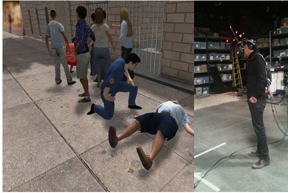
Figure 1: Hunger In Los Angeles (2012). Viewer on right is using prototypical VR hardware that would later become the Oculus Rift.

established independent design grammar [6]. VRNF experiences are drawing inspiration (and blending characteristics) from gaming and immersive theatre, alongside traditional filmmaking practices [22]. However, despite growing content and exposure within the VR and filmmaking communities, VRNF is relatively understudied by the HCI community.