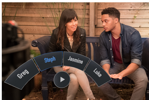
Figure 4: Branching narrative gaze selection. Decisions: Party's Over (2018)

objects and / or to activate a cutscene, while other examples allowed viewers to make simple binary decisions within a non-linear / branching narrative . An example of such selection is seen in Decisions: Party's Over (2018, fig. 4).