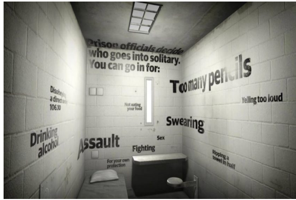
Figure 3: Diegetic visual annotations. 6x9: A Virtual Experience of Solitary Confinement , 2016.

short time in a single location. The Oculus Rift and HTC Vive headsets used for our review both provide a horizontal visual field of 110 degrees. Though this compares well to the human binocular visual field (approx. 120 degrees), the full horizontal human visual field including the monocular / peripheral region reaches approx. 200 degrees [20]. With such a restricted level of peripheral vision, failure to manage where the viewer is looking in VRNF content can easily result in key information being missed.