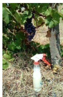
Fig. 9 Untreated