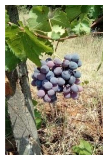
Fig. 10 Treated