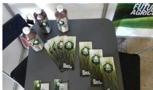
Fig. 12 Examined preparations in packaging