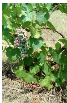
Fig. 7 Untreated