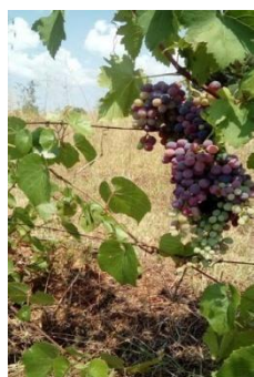
Fig. 8 Treated