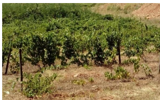
Fig. 11 Treated vines in the plantation