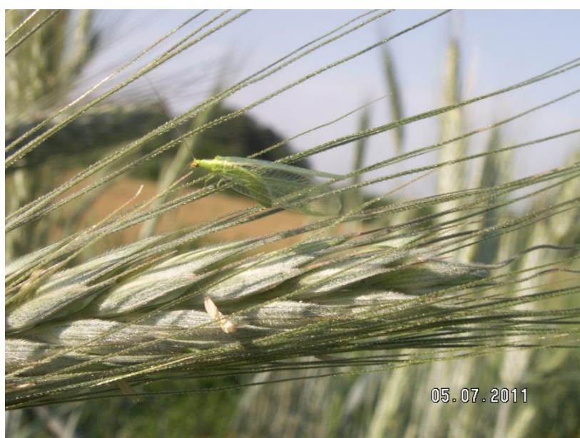
Picture 2. Chrysopa perla L. on a ear

During the research in Leskovac, the predatory activity against aphids was registered among the following five ladybird species belonging to the family Coccinellidae (Coleoptera): Coccinella septempunctata L., Adalia bipunctata L., Hippodamia variegata Goeze (Figure 1), Propylea quatuordecimpunctata L. and Calvia quatuordecimpunctata L. Two species of green lacewings belonging to the family Chrysopidae (Neuroptera), namely Chrysopa perla L. and Chrysopa carnea Steph. were also registered as predators (Picture 2).