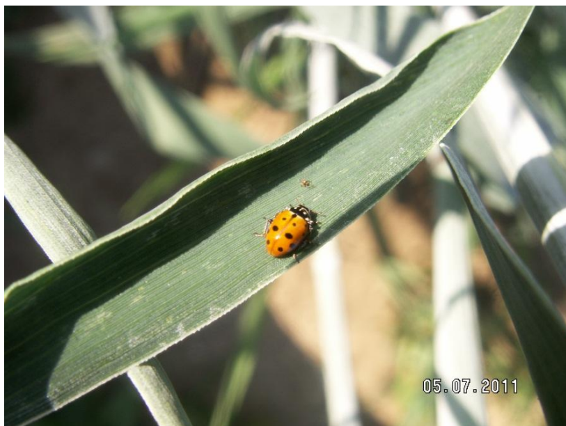
Picture 1. Hippodamia variegata Goeze on a leaf