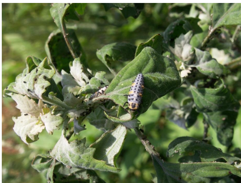
Picture 3. Aphids colonies and larvae C. septempunctata L. on a Chenopodiaceae

greatest predatory activity in 2012, when the greatest number of aphids was also recorded. The increased presence of weeds was registered in the peripheral parts of the research plots, where the increased number of aphids and ladybirds was also registered during all visual examinations. The most prevalent weeds were: Chenopodium album L. (Chenopodiaceae), Atriplex patula L. (Chenopodiaceae), Convolvulus arvensis L. (Convolvulaceae), Sorghum halepense L. (Poaceae), Cichorium intybus L. (Asteraceae) and Polygonum persicaria L. (Polygonaceae). The greatest number of aphids colonies was registered among weed species belonging to the family Chenopodiaceae (Picture 3).