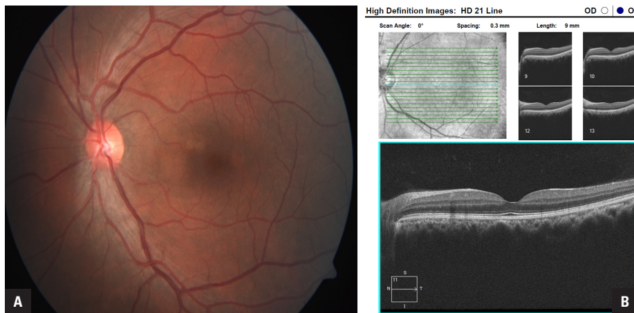
FIGURE 2A. Colour fundus photograph of patient same patient eight weeks post-subthreshold laser showing resolved neurosensory detachment with normal appearing fovea. B. Spectral domain optical coherence tomography (SD-OCT) of the left eye of the same patient showing normal fovea with completely resolved neurosensory detachment

lung disease after discontinuation of therapy in a patient who received treatment for 10 weeks [7].