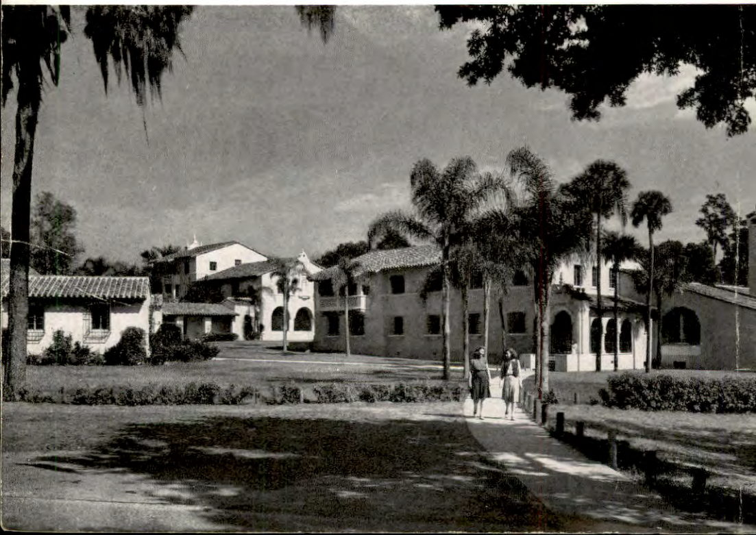
THE WOMEN'S QUADRANGLE SHOWING STRONG, CROSS, AND FOX HALLS