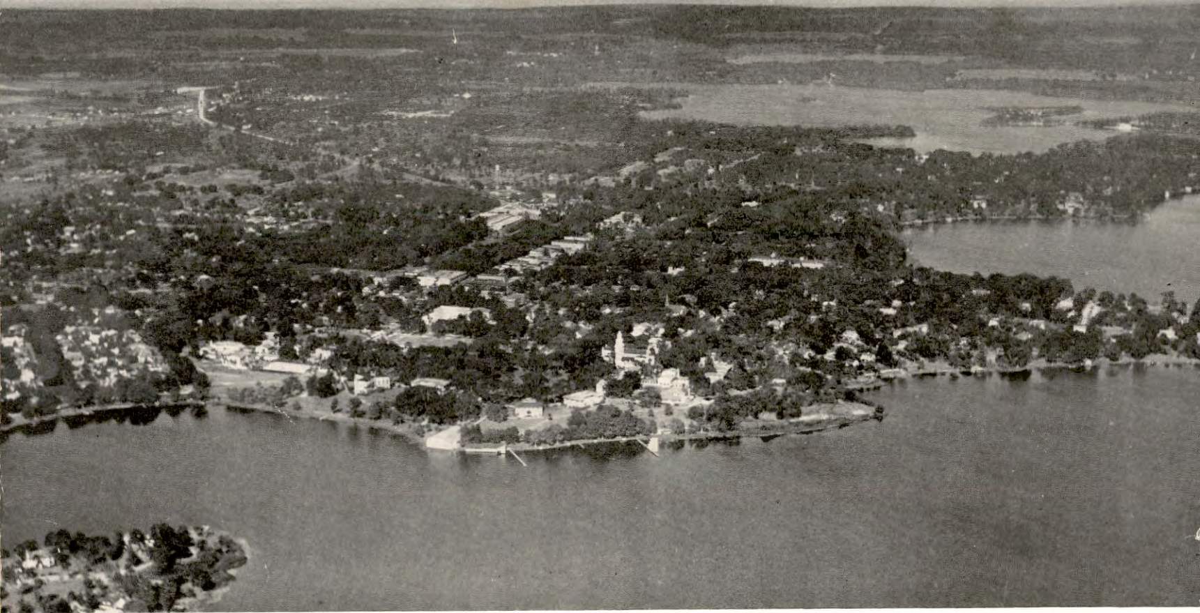
AIRPLANE VIEW OF THE CAMPUS AND CITY OF WINTER PARK SHOWING THEIR BEAUTIFUL LOCATION AMONG THE LAKES