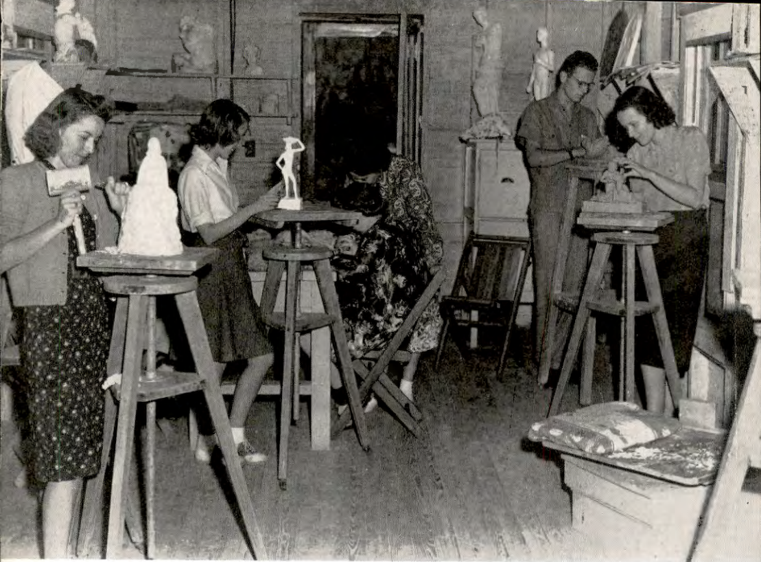
ROLLINS STUDENTS IN SCULPTURE HAVE WON MANY PRIZES