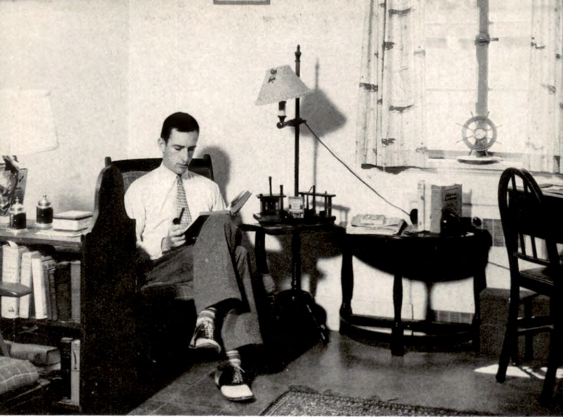
A TYPICAL STUDY ROOM IN ONE OF THE MEN'S DORMITORIES