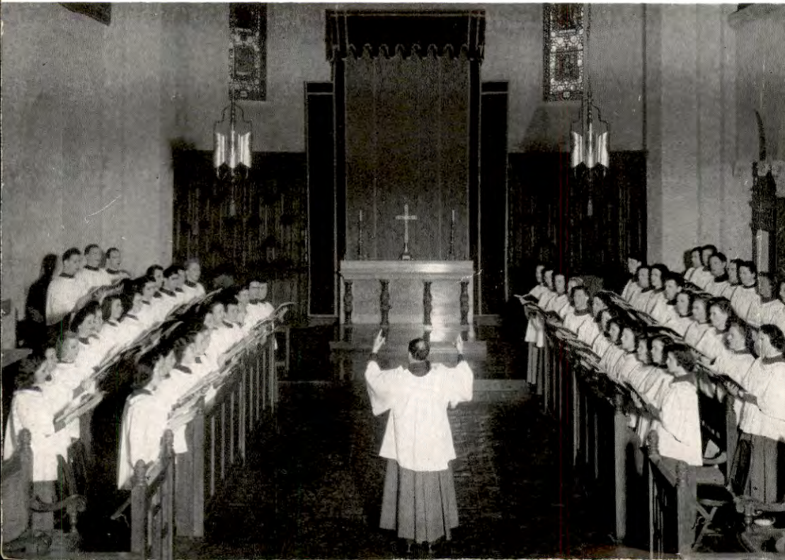
APPROXIMATELY SIXTY ROLLINS STUDENTS SING IN THE CHAPEL CHOIR