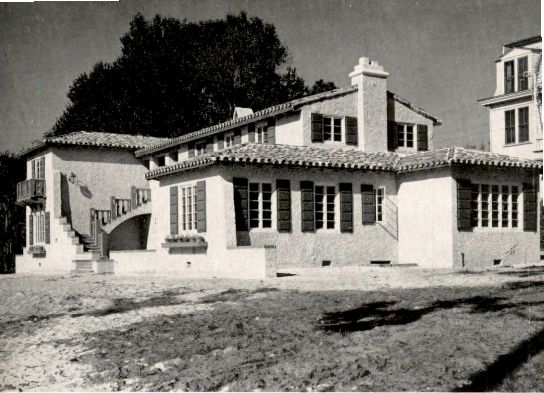
LA MAISON PROVENCALE FOR CLASSES IN FRENCH LANGUAGE AND CULTURE