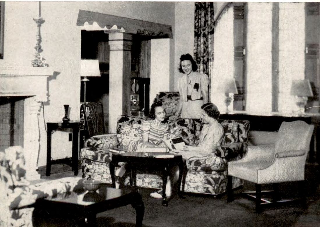
VIEW OF LIVING ROOM IN ONE OF THE WOMEN'S DORMITORIES