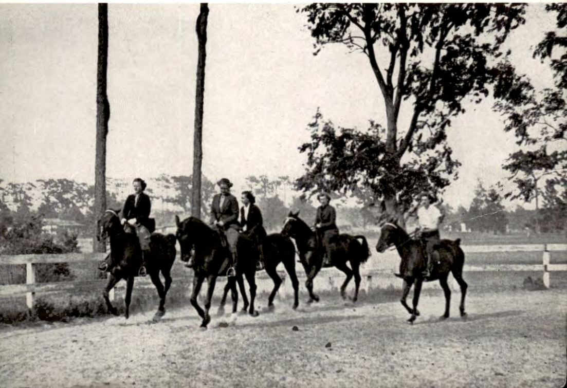
RIDING IS AN APPROVED PHYSICAL EDUCATION ACTIVITY