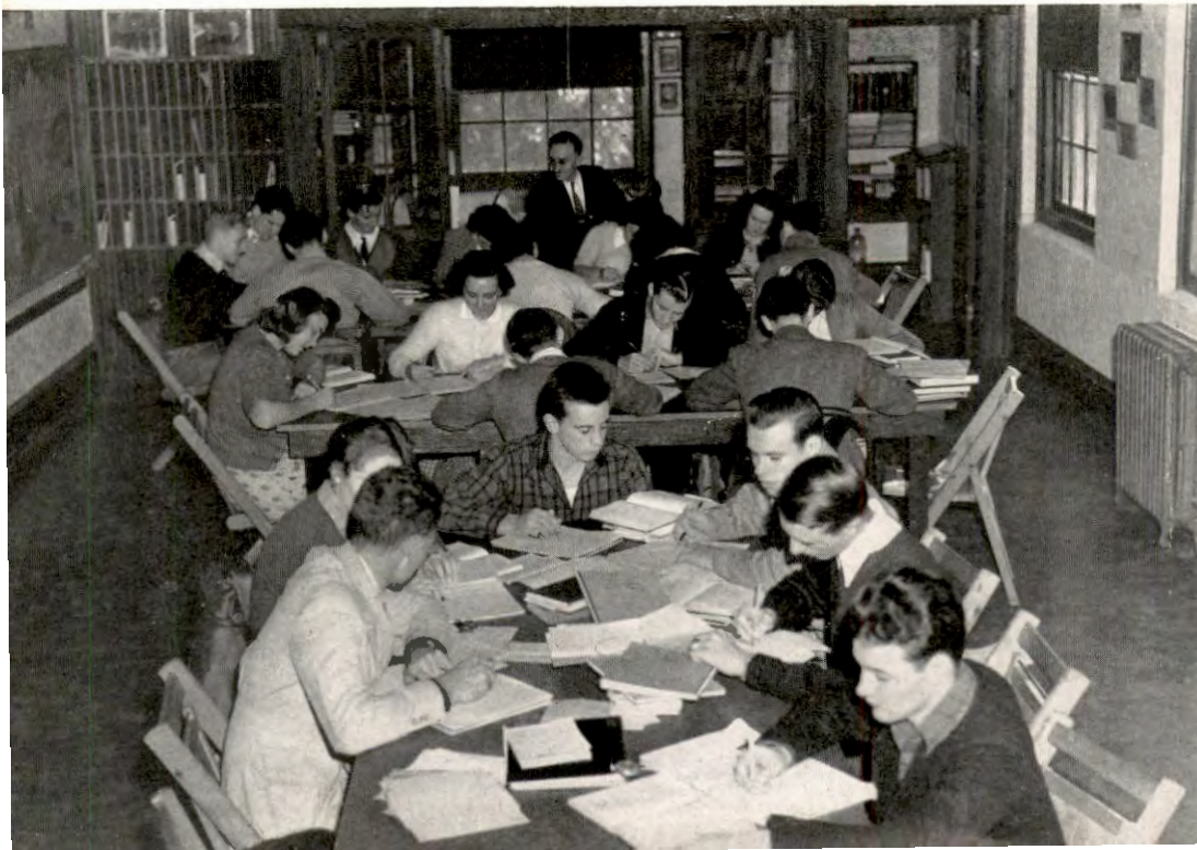
CLASS AT WORK UNDER THE CONFERENCE PLAN