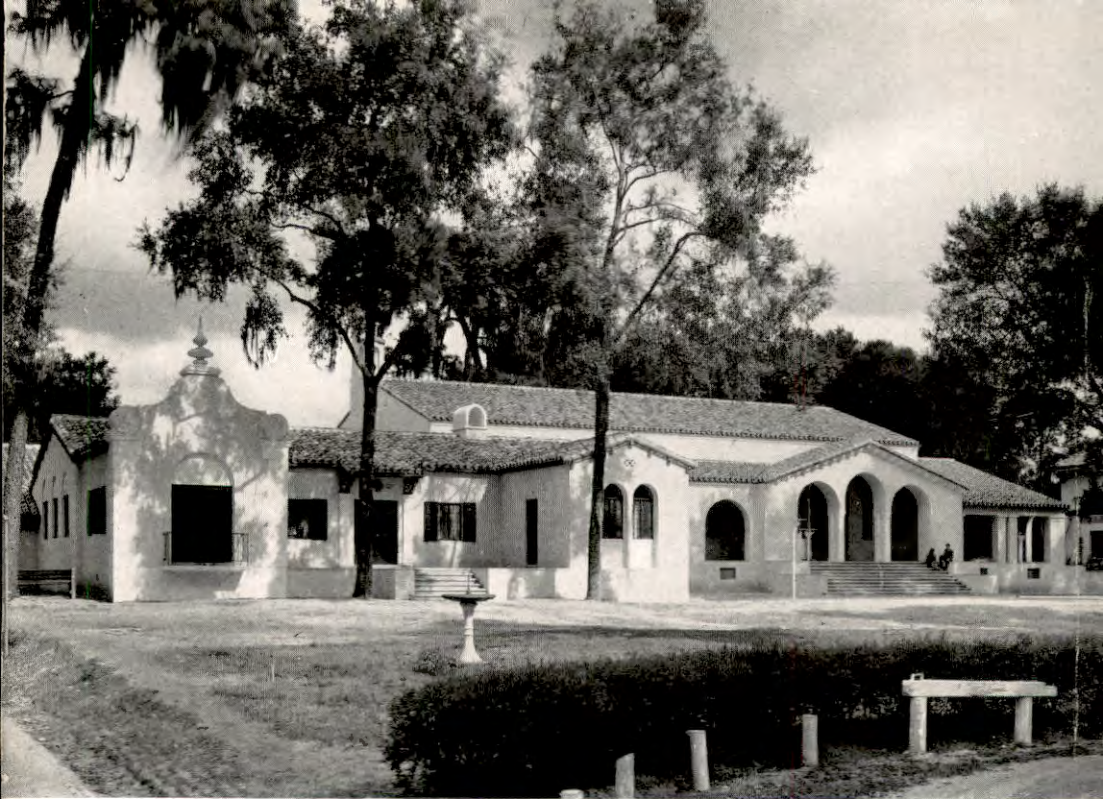
THE ROLLINS CENTER, HUB OF STUDENT AND ALUMNI ACTIVITIES