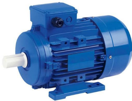
Figure 1. Appearance display of rare earth permanent magnet motor.