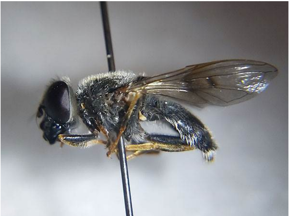
Figure 1. Cheilosia herculana Brădescu, 1982, habitus, female.

The only registered species from the C. caeruleascens group in Serbia is Cheilosia kerteszi (Szilády, 1938), collected on Mt. Rtanj (Radenković, 2008; Vujić et al. 2018).