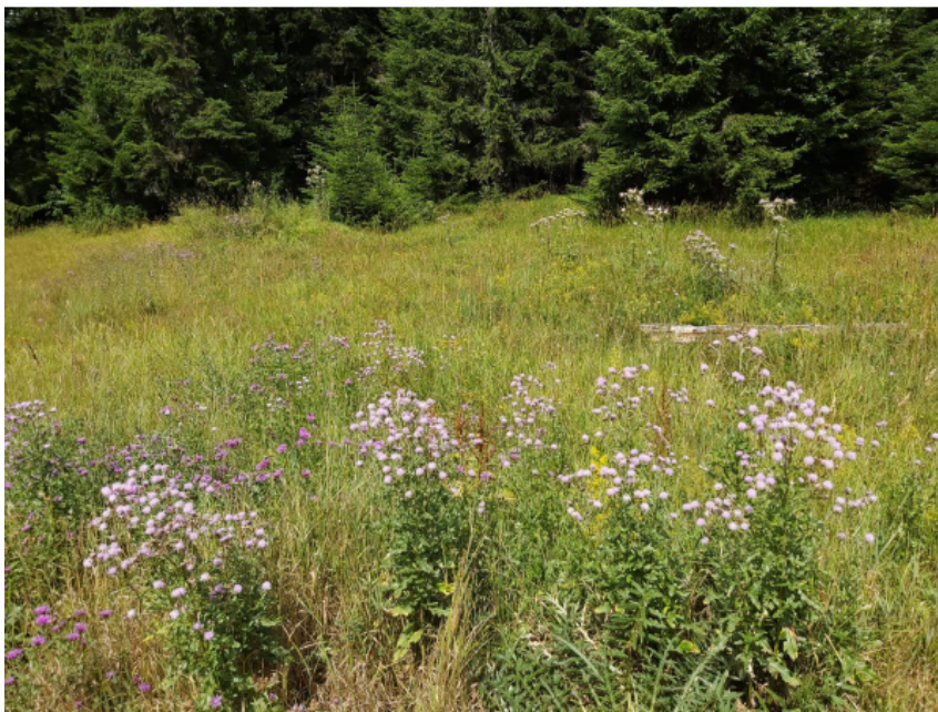
Figure 2. Habitat of Cheilosia herculana Brădescu, 1982 on Jadovnik Mt.