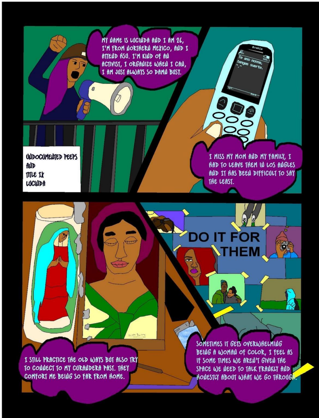
Figure 2 The first page of the comic book made for CHECK IT for Title IX awareness.