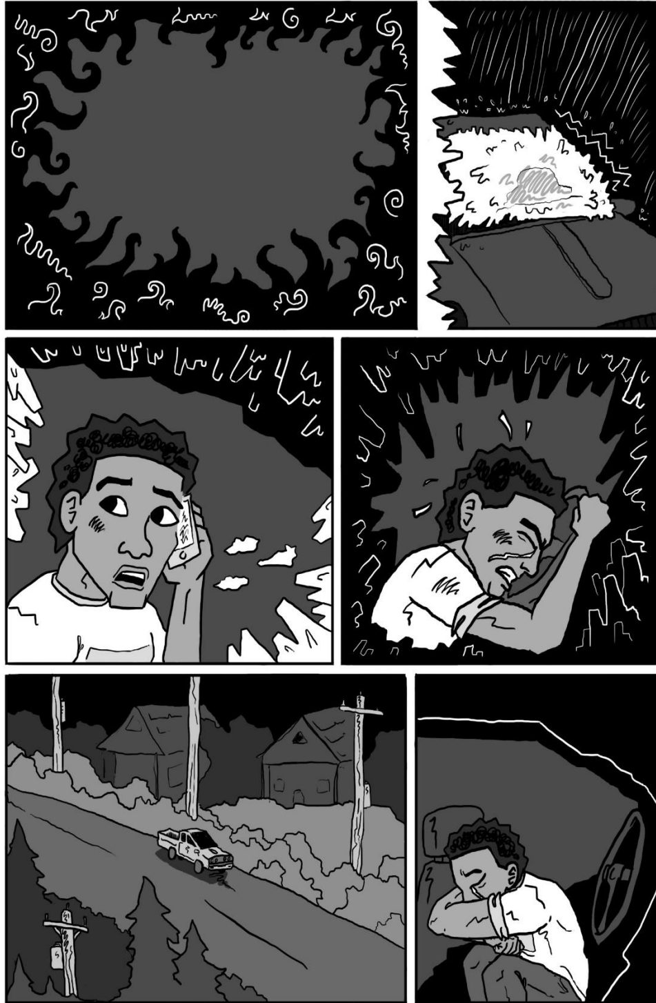
Figure 5 Page 9 (In)difference to survivors, Brandon Vegh, Unpublished 2019