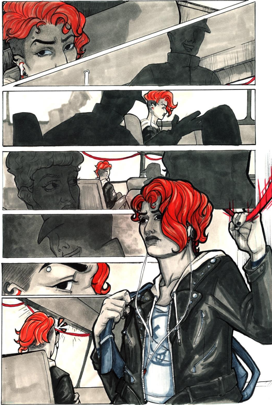
Figure 4 Page 4 (In)difference to survivors: Lucinda, Alison Pitts, Unpublished 2019