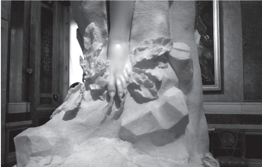
Apollo and Daphne by Gian Lorenzo Bernini (1598–1680).

to bark and hair to leaves; we apprehend motion as Daphne's body parts turn dramatically into stalks, blades, and laurel leaves, all conveyed through marble.