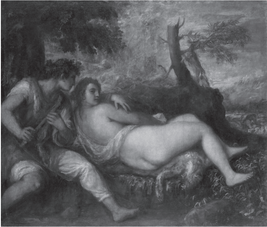
Nymph and Shepherd by Titian (1488–1576). Creative Commons license.