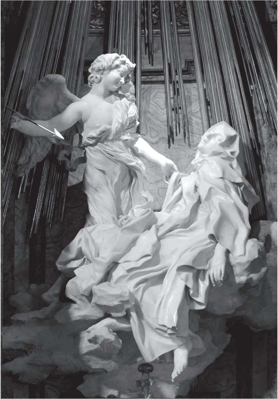
The Ecstasy of Teresa by Gian Lorenzo Bernini (1598–1680). Creative Commons license.