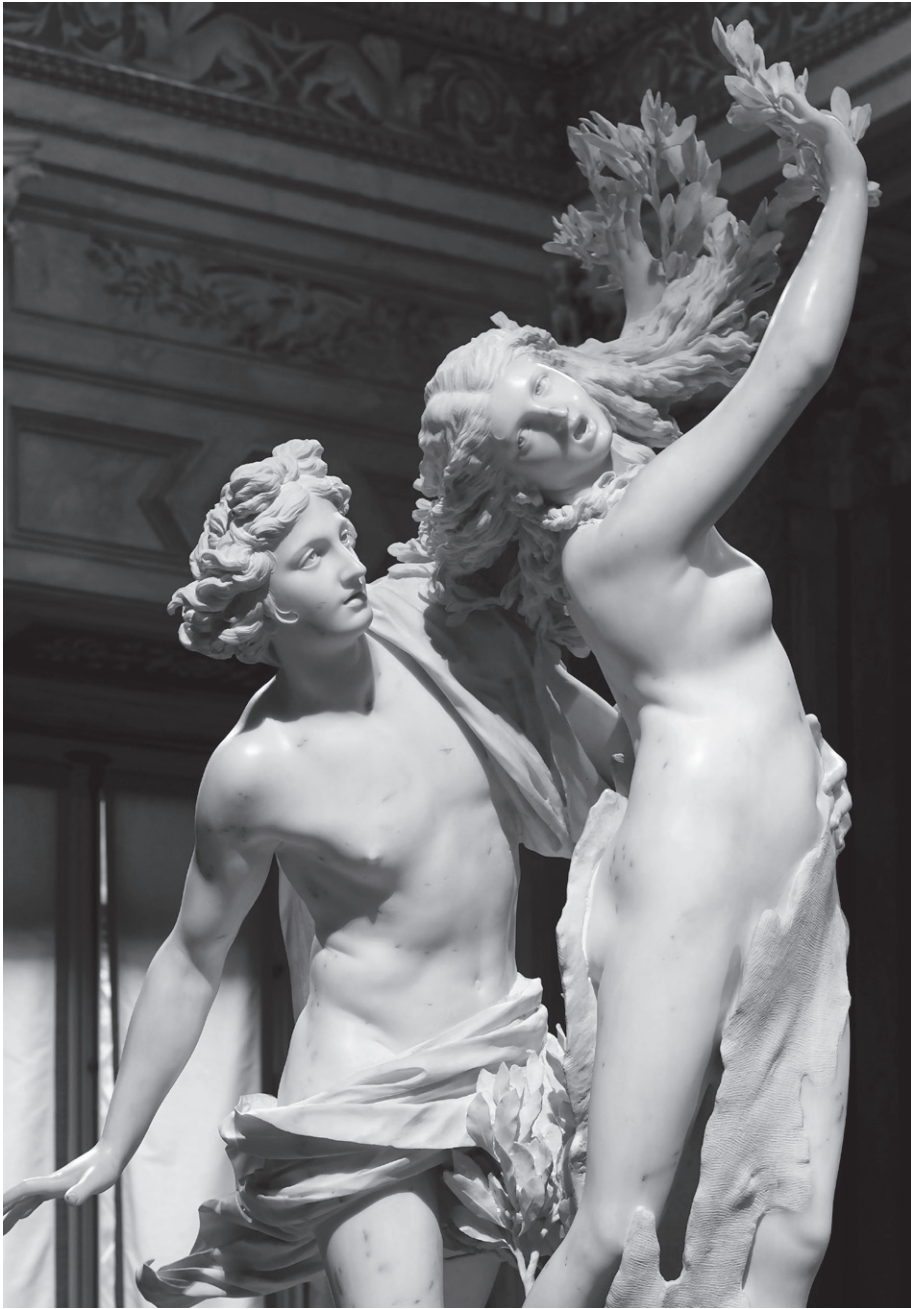
Apollo and Daphne by Gian Lorenzo Bernini (1598–1680).