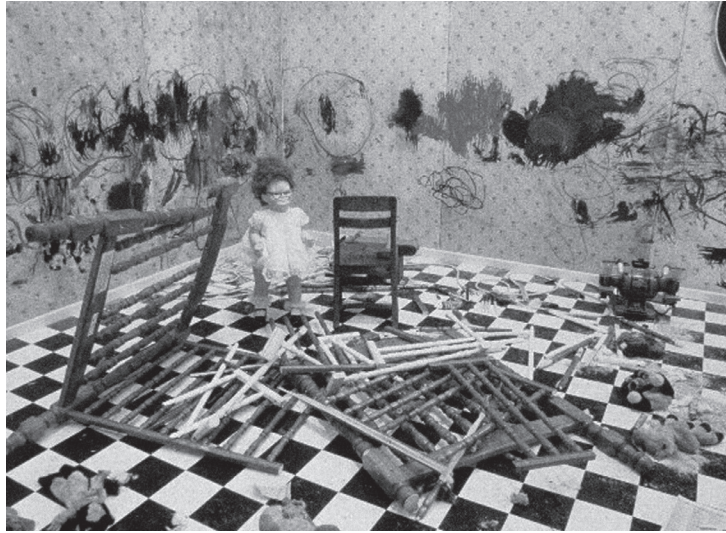
(left): Kim Dingle, Priss , 1994. Mixed media. Courtesy of the artist.