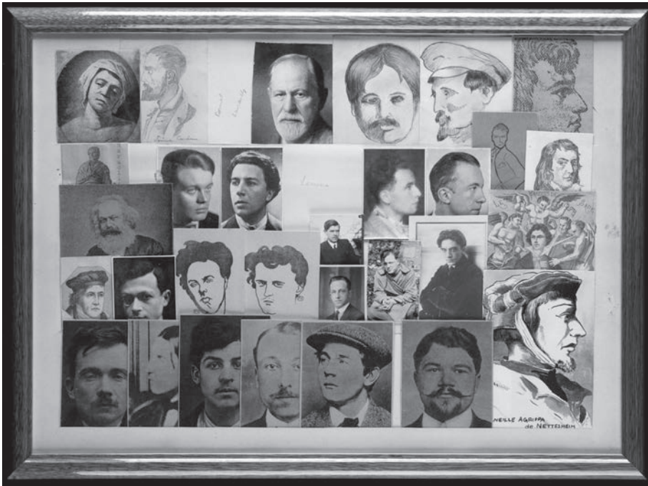
Figure 4: Louis Scutenaire, "Pêle-mêle" [Le Panthéon surréaliste]. Collage with frame. Photographed by Alice Piemme. With the kind authorization of the Archives et Musée de la Littérature of Brussels. This collage was later also reproduced in Documents 34, Intervention surréaliste , July 1934, 50.