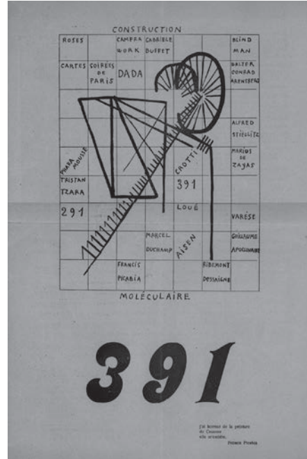
Figure 3: Cover of 391, n° 8 (Zurich, 1918) with Francis Picabia's ink drawing Construction moléculaire .

neological tree-models in art history construct a developmental pattern from artists' or writers' discursive claims of affiliation or from formal as well as thematic similarities between works, the cover here constructed a pattern that drew on an arrangement of language's materiality. Spanning a period of ten years, this book took stock of the avant-gardes by building a conceptual or linguistic tree around the etymon or stem ISM, which took up the function of the trunk here. The cover fleshes out a genealogy that is as much driven by this formal-linguistic constraint as by actual historical developments. All words or isms on the cover as it were branch out as boughs or limbs of a much larger trunk, the capitals ISM. Around and tied to this vertical etymon ISM, all branches are on a par, all equal, all horizontal.