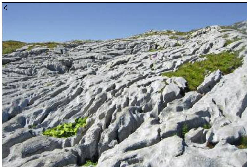
Figure 3: (a) A view of the glacio-karst of Tsanfleuron. (b) The part of the karren field deglaciated since the beginning of the Holocene. (c) A detail of karren fields.