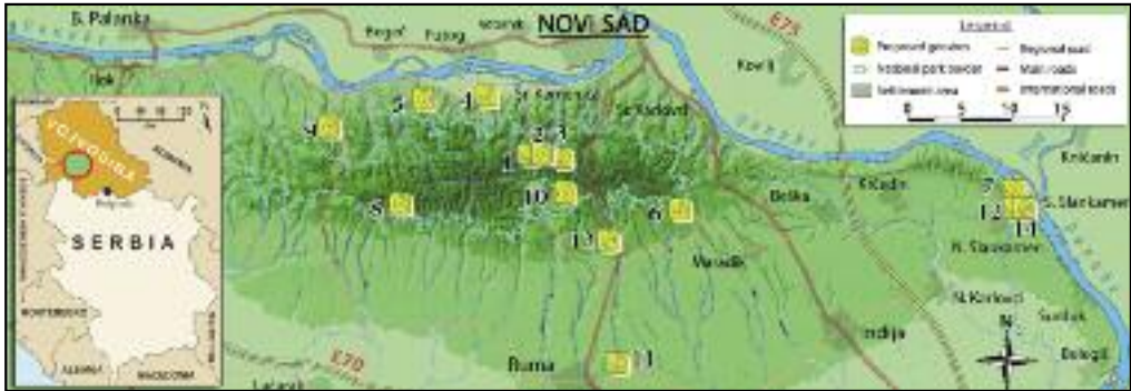
Figure 1: Location of Fruška Gora Mountain with disposition of proposed geosites (Marković, 2007b, modified).