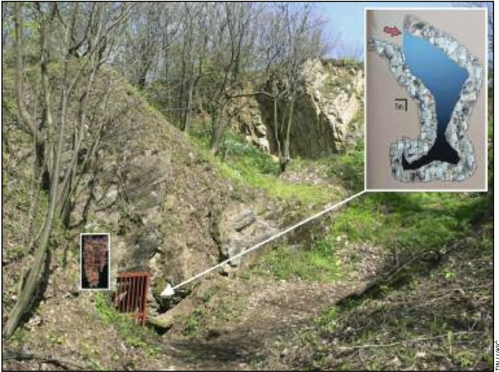
Figure 2: Grgurevac cave – unique karst underground geomorphological object in Vojvodina, northern Serbia.

Fruška Gora was proclaimed a National Park in 1960 with 25,525 ha of protected area due to its rich, rare and endangered biodiversity. Flora is presented by 1,454 species (Butorac 2007), while fauna refers primarily to ornithofauna with more than 200 species (Habijan-Mikeš 2007). Additionally, within the Park and wider area of Fruška Gora Mountain, there are numerous historical and cultural monuments with almost 20 orthodox monasteries hidden in the woods which earned this destination the epithet ‘the Holy Mountain’ apropos Serbian Atos (Davidov 2007).