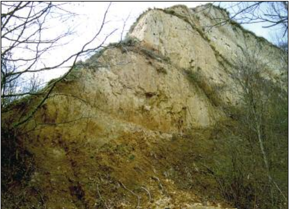
Figure 4: Profile Čot near Stari Slankamen village, the most significant loess section in the Vojvodina region.

The first group of main indicators, scientific and educational (VSE) values, shows highest values (Grade 1) of subindicators rarity and representativeness as this site represents one of the most complete palaeoclimatic and palaeoenvironmental archive on European land (Marković et al., 2007a). Also, numerous scientific papers regarding this site, published in acknowledged international journals (e.g. Marković et al. 2007a, 2008, 2009, submitted), also bring the highest grade for knowledge on geoscientific issues. All this resulted in the highest interpretation level as it is concluded that the Stari Slankamen loess profile represents an excellent example of palaeoclimatic and palaeoenvironmental records of the Middle and Late Pleistocene