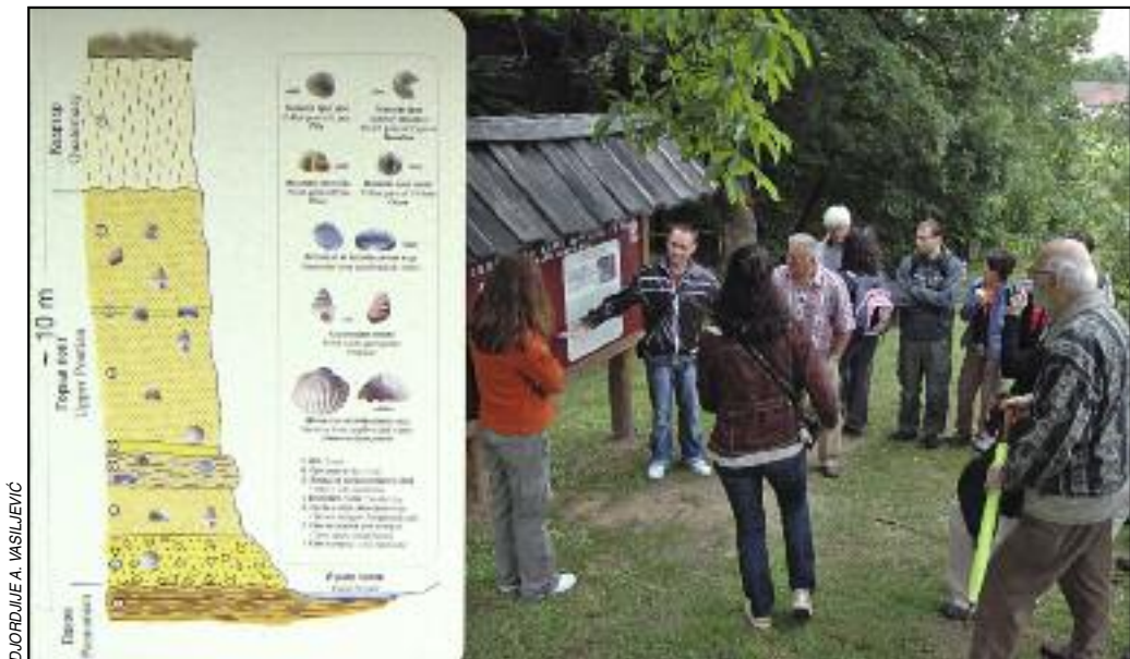
Figure 5: Geosite Grgeteg – palaeontological locality of the mio-pliocenic fossils, interpreted by T. Lukić during the Geotrends 2010 conference fieldtrip.

viewed in order to assess the value of each indicator's elements, as the elements are of unequal importance with regard to tourism planning and management. For example, within the main values, interpretation level and rareness or representativeness of site, which are relatively constant in time (except if major discoveries occur), should be considered as more valuable than its surface or environmental fitting. Evidently, for the purpose of geotourism development, it is more important to form or improve guide services or interpretive panels (Figure 5) than to have the road network or some additional functional values developed. Consequently, this is why scientific/educational and protection values should be evaluated by experts