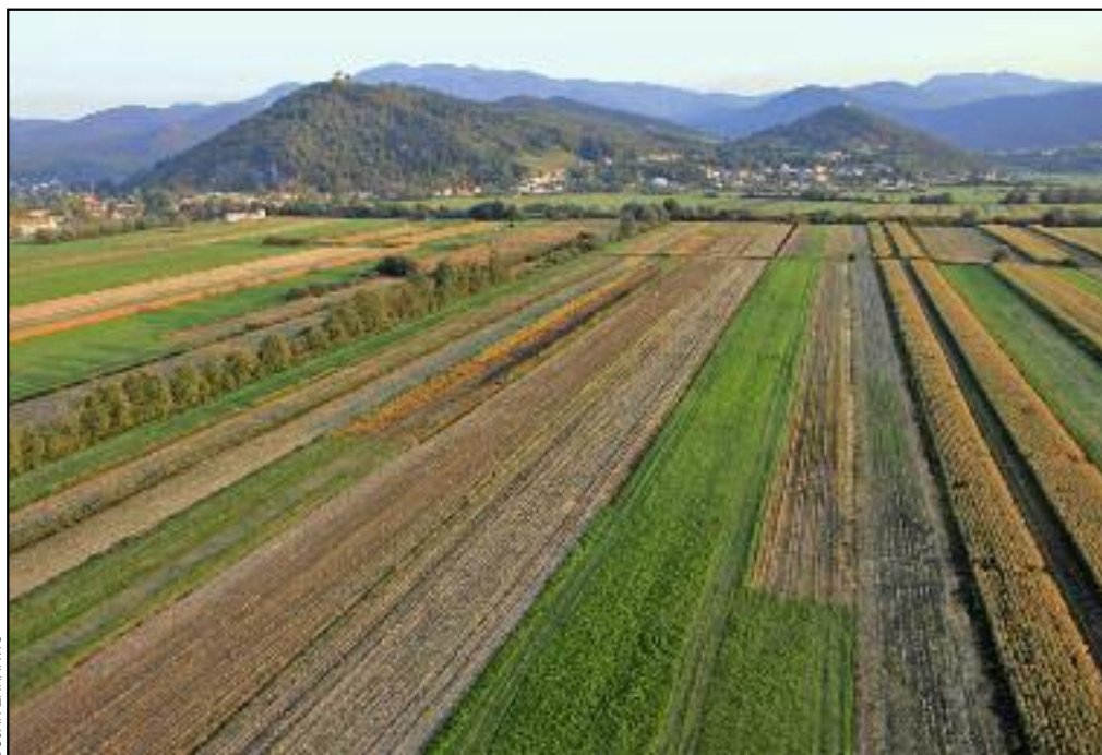
Figure 2: Aerial view of the mosaic-like landscape of the Ljubljana Marsh.