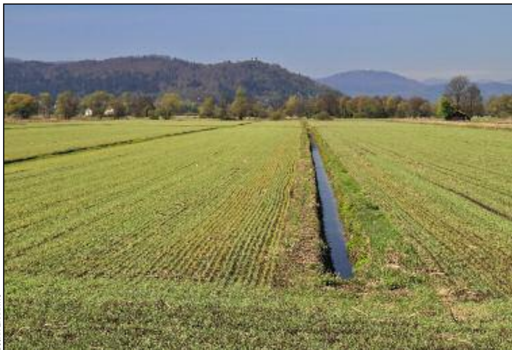
Figure 1: The Ljubljana Marsh is crisscrossed by numerous drainage channels.