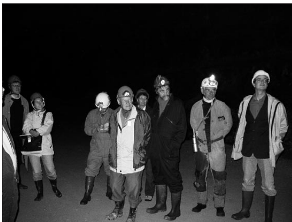
Fig. 3: On a field trip in Chalk karst of Normandy in 2003.