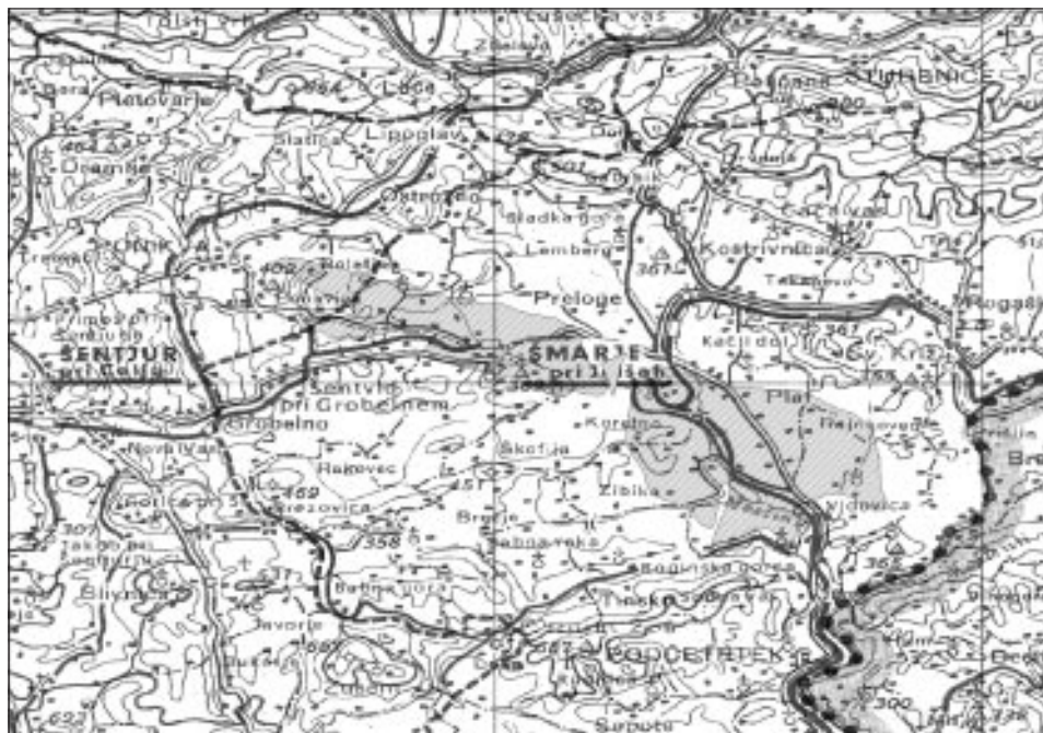
Fig. 2: Isolated karst on lithothamnian limestone between Ponikva and Mestinje with marked entrance to Osovniška jama (Base is map of Slovenia 1 : 250000).

Osovniška jama developed in such a patch of lithothamnian limestone extending from Ponikve to Mestinje on the north from Šmarje near Jelše in E Slovenia (Fig. 2).