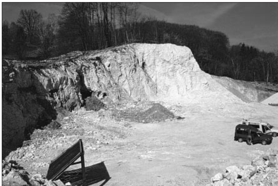
Fig. 4: Middle Miocene lithothamnian limestone in the quarry is massive and heavy tectonic crushed.

Sl. 4: Srednjemiocenski litotamnjski apnenec je v kamnolomu masiven in močno tektonsko pretprt.