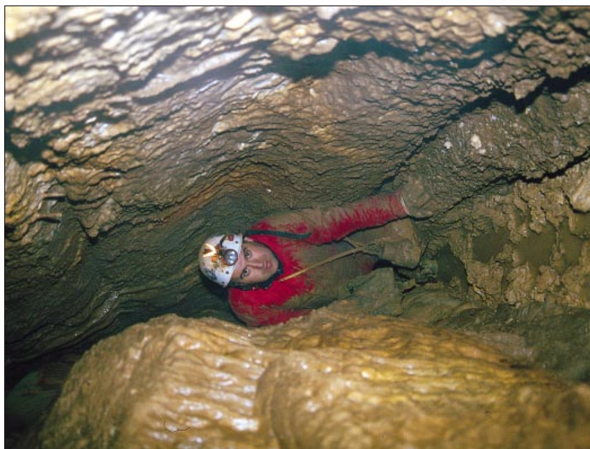
Fig. 7: The percolation water is collected in the bottom of the lower passage.

Sl. 8: Beli stalaktiti in stalagmiti iz rova v srednjem delu jame.