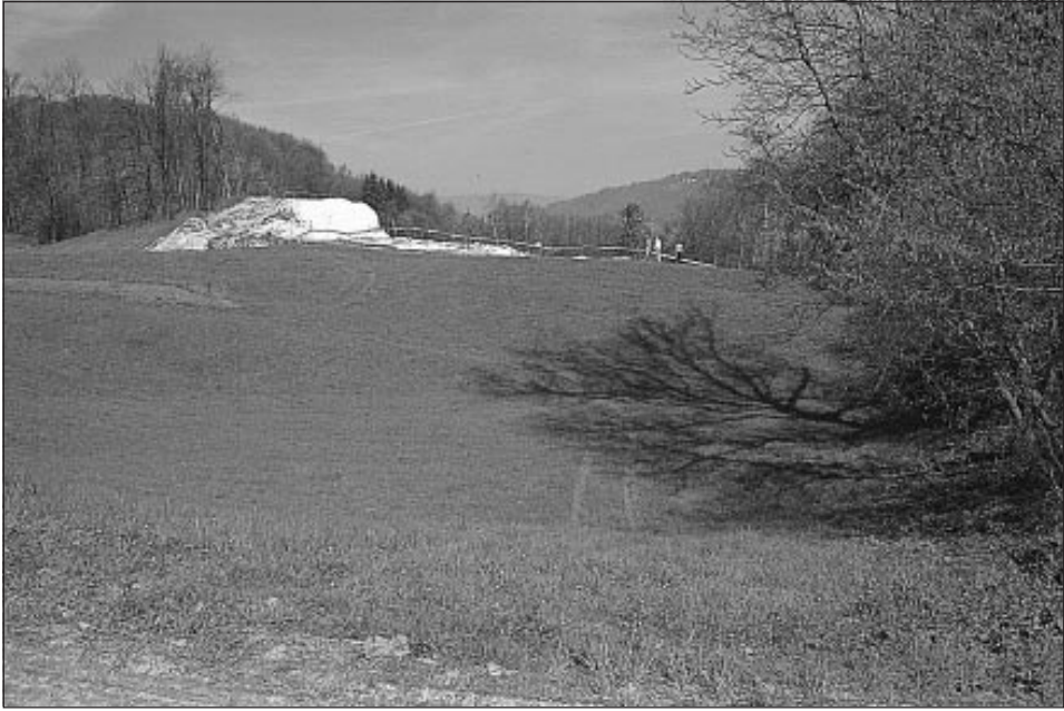
Fig. 3: Pijevci quarry with doline in front of the picture. Below the doline the upper part of the cave is ended.

Sl. 3: Kamnolom Pijevci z vrtačo v ospredju slike. Pod vrtačo se konča zgornji del jame.