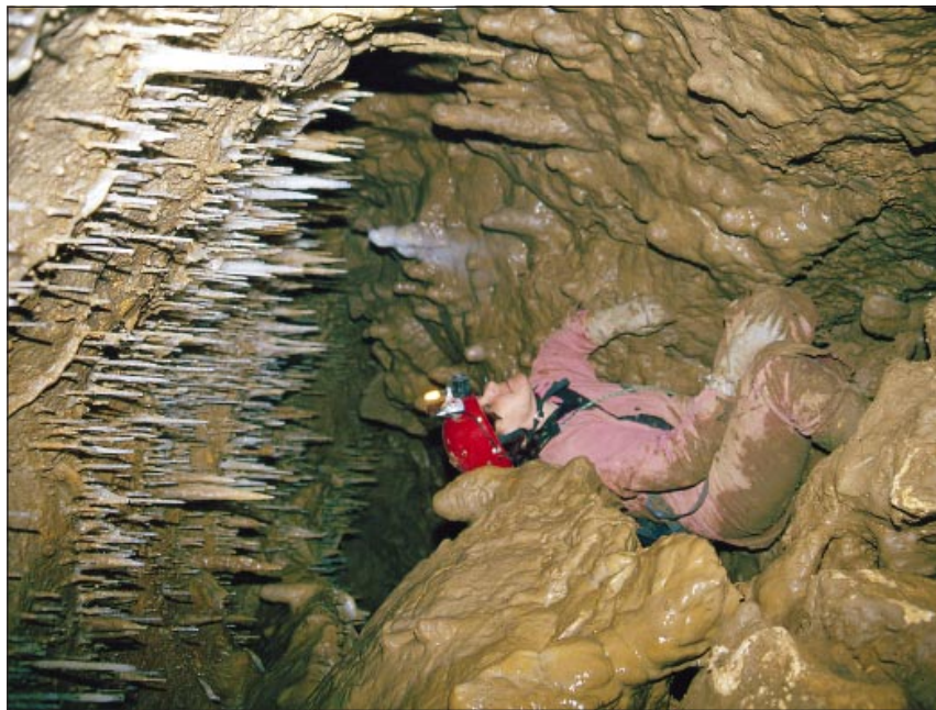
Fig. 8: White stalactites and stalagmites from the passage in the middle part of the cave.

Sl. 8: Beli stalaktiti in stalagmiti iz rova v srednjem delu jame.