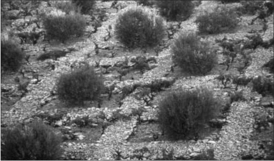
Photo 12: Internal geometrical structure of characteristic fields around Primošten is very complex. It is made of a symmetrical screen of drystone walls, circled by small arable plots which were primarily adapted to grapevine growing. Today, without road access or the use of machinery, grape growing is being abandoned, and olive becomes the main culture (2000).