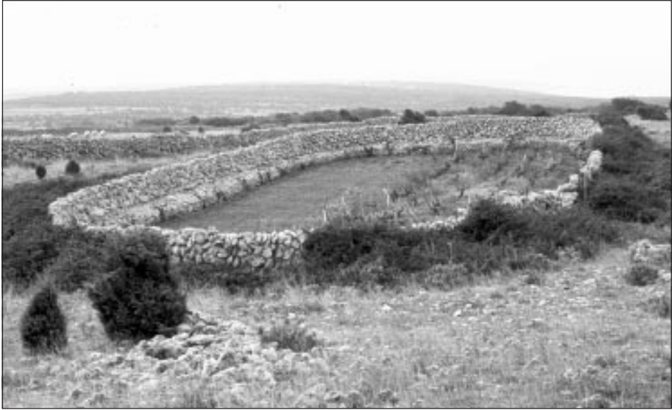
Photo 2: One of the rare preserved arable karst valleys on the island of Krk. It is characteristic for its symmetrical fragmentation of farming plots (1994).