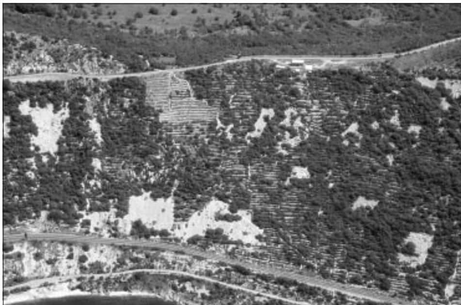
Photo 14: Landscape with cultural terraces and escarpments near the Bay of Bakar. Typical for very steep slopes at 50-70m altitude. When farming is discontinued escarpments in steep areas break away into a sipara, making the area unfavourable for vegetation growth (2002).

but not excluding regionally determined categories) of national importance, accompanied by the relevant protection guidelines.