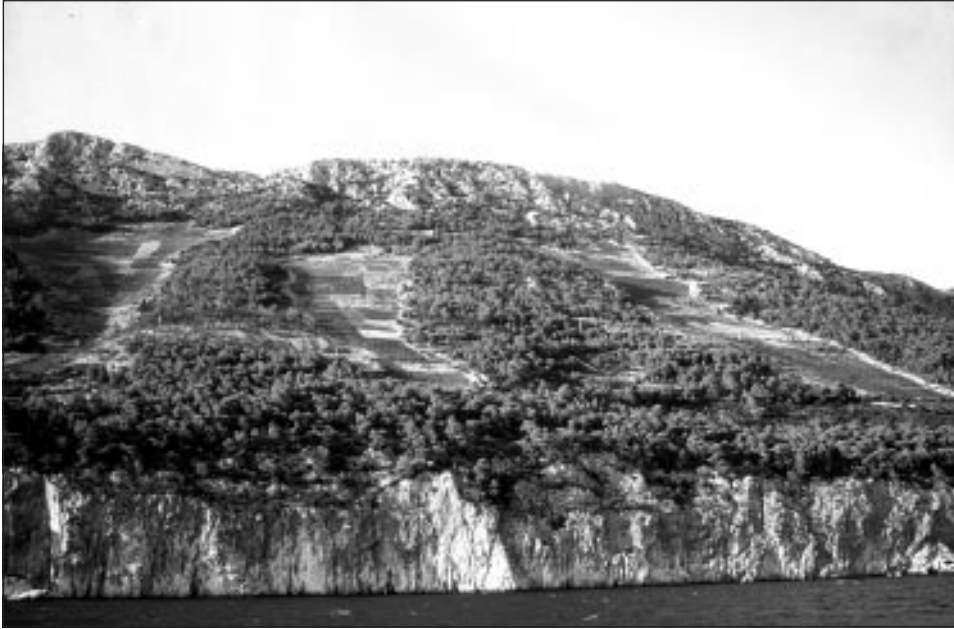
Photo 7: Southern slopes of the island of Hvar. Picturesque landscape filled with contrasts. It is specific for its steep slants, leaning up to 50 per cent, situated within drainage depressions and made of gravel detritus and similar material. Due to its porosity, they are not prone to erosion and are therefore suitable for grape growing. Such surfaces are more resistant to technological changes caused by soil cultivation, and are able to maintain their original forms longer (2001).

5. The fifth landscape type is made of terraced drystone walls. These were created on karst slopes with 6-20 degrees inclination. Stone was gathered and piled along the slopes in the form of escarpments in order to form terraces. They come in a) symmetrical and b) asymmetrical shapes. Asymmetrical terraces can be found on moderate slopes (Photo. 8), suited suitable for growing fruit trees (fig, olive, carob-tree, citruses, etc.). The trees grow far apart and planting in regular straight rows is not required, which allows for rock outcrops to remain untouched in the ground. This results in smaller planting plots, with semicircular, fairly short escarpments at the foothills (Photo. 9).