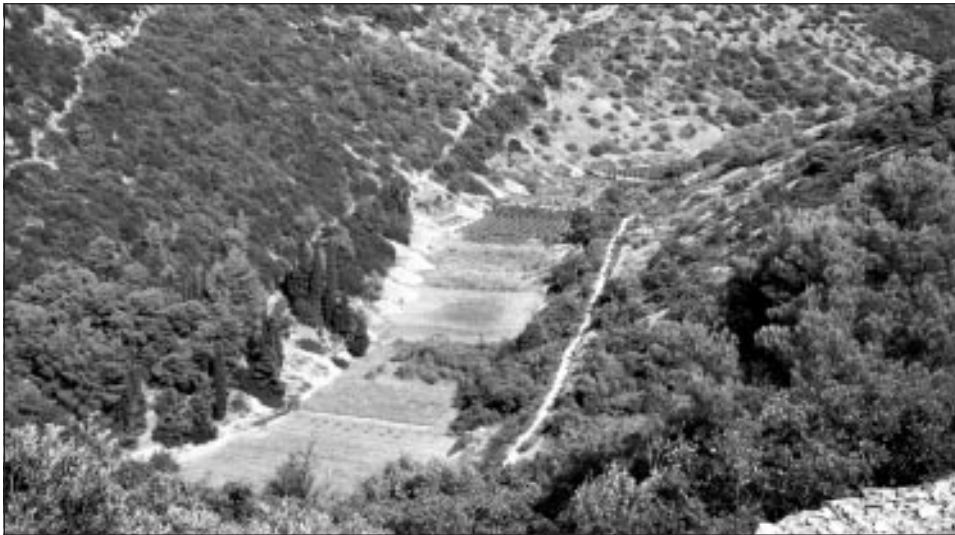
Photo 5: Symmetrical series of karst valleys (Brač). The distribution of valleys is a result of micro-relief forms. Quality soil, the possibilities of its mechanical tillage and easy access, have all enabled revitalisation of most similar valleys (1997).