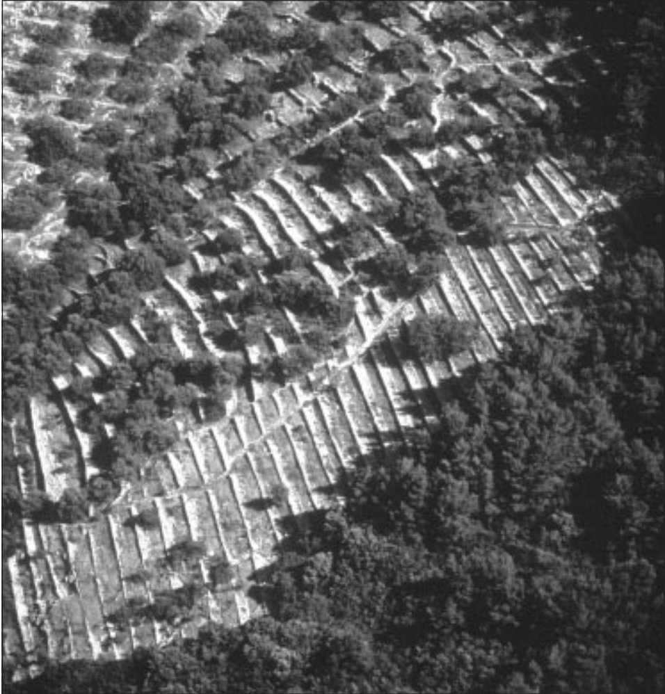
Photo 10: Cultural terraced landscape on the island of Hvar. Inaccessible, steep terraces, unique example of superhuman farming efforts and pains, are left to erosion and complete overgrowth.

(Photo. 10 and 11). However, there are terraces created on the slope of 20^\circ and more, where escarpments are compact, and some even supported by a solid rock, therefore distances between them vary. On lower level terrain, with predominant karst surfaces, terraces are predominantly rectangular, with escarpments coupled by transversal partitions and larger heaps of stone ( gomilas and varvakanas ) (Photo. 12 and 13).