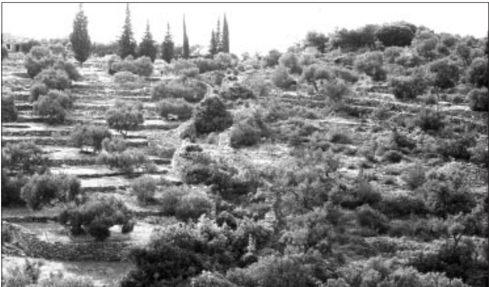
Photo 9: Brač. This landscape type is characterised by asymmetrical terraces which for centuries served as olive groves, and their individual remnants still bear witness to the irreplaceable culture of traditional utilitarian Mediterranean landscape.