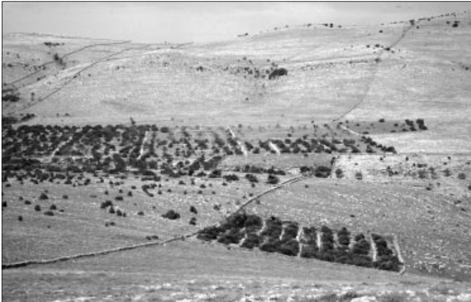
Photo 1: Kornati archipelago. Among the rocks and karst, straight drystone walls (pasture boundaries) and individual olive groves fenced by symmetrical walls contribute to the immense value of the landscape. Disappearance of grazing and growth succession are robbing this area not only of the cultural, but also of its geomorphologic identity (2001).