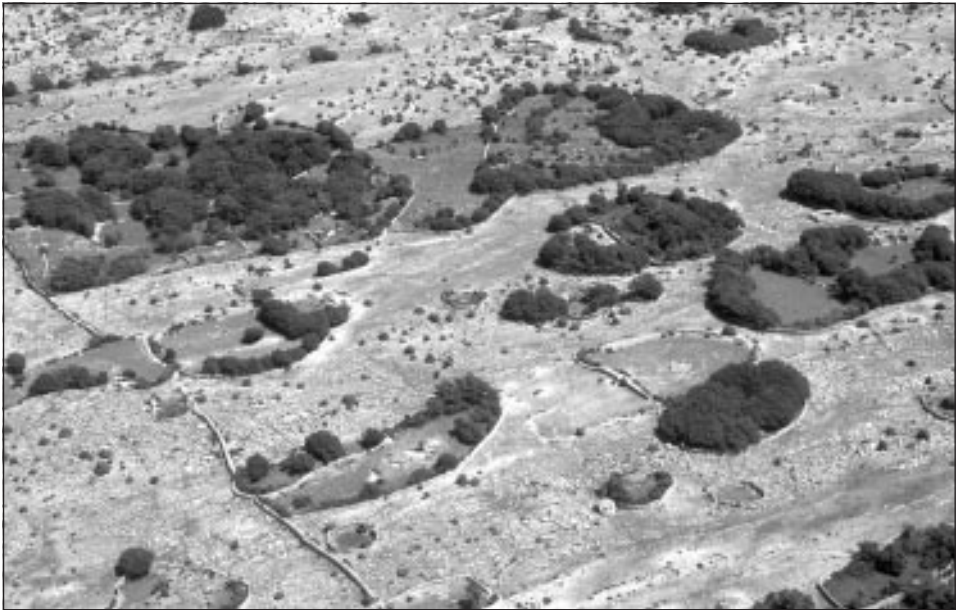
Photo 3: Landscape with sinkholes (cattle folds on Krk). It is found on rocky parts of mild slopes. Poor grassland vegetation has favoured the construction of folds, where cattle were sheltered from sun and bad weather. Today, almost all sinkholes are exposed to overgrowth (2002).