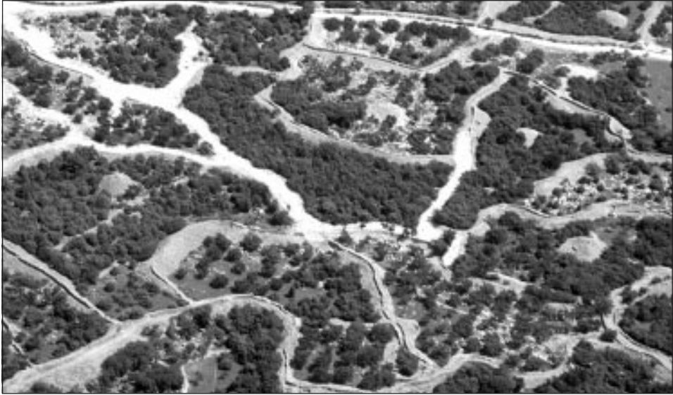
Photo 8: Krk. This, and similar landscapes, were created on mild slopes with thick, quality soil. Heaps of stone of various widths and asymmetrical lines are disappearing today, because stone is crushed and transported away for other activities, which leads to gradual but permanent loss of this characteristic landscape (2002).