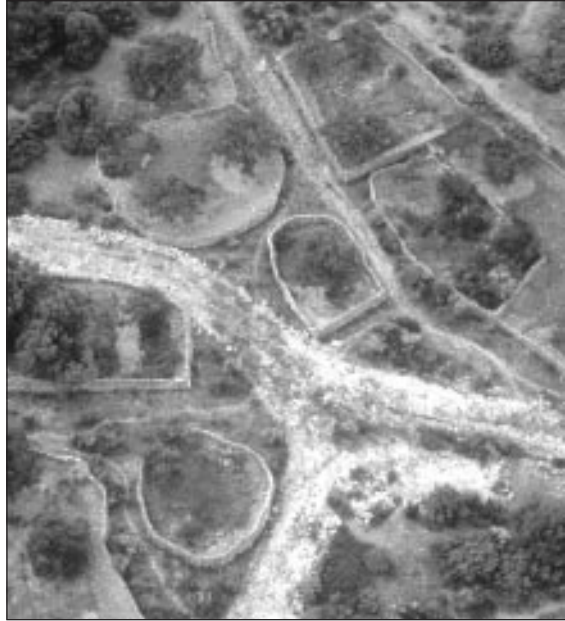
Photo 4: The Trogir surroundings are rich in valuable, picturesque landscape scenes composed of small enclosed and abundant fields.