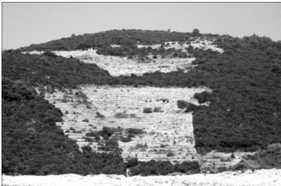
Photo 11: Cultural terraced landscape on the island of Korčula. Terraces with escarpments created on slopes are symmetrically formed stretches, following the topography. Width of terraces varies depending on the inclination, and plots are fragmented by regular or alternating transversal lines, made of drystone walls or asymmetrical heaps of stone, thus creating small rectangular plots of various sizes. Abandoned plots are overgrown by maquis and pine. The vicinity of settlements, new incentives, and the trend of switching back to grape growing and wine making, bring these and similar areas back to life (2002).