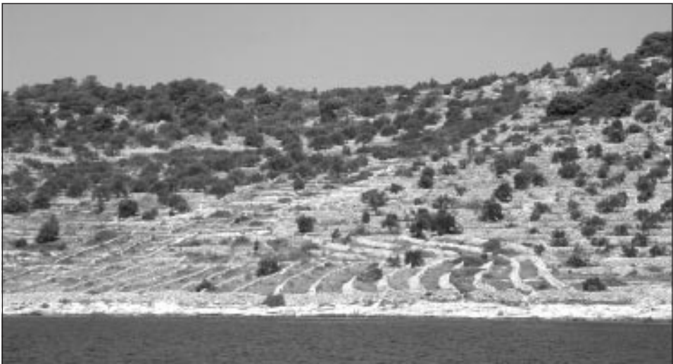
Photo 13: Kakan. Abandoned, unpopulated island; once the entire island was arable land. Its entire surface is intersected by drystone walls of various symmetrical and asymmetric shapes, various heights and widths. Climate and soil conditions were favourable for agriculture, which is visible from the remains of olive groves and drystone walls along the entire coast, almost reaching the sea (2001).