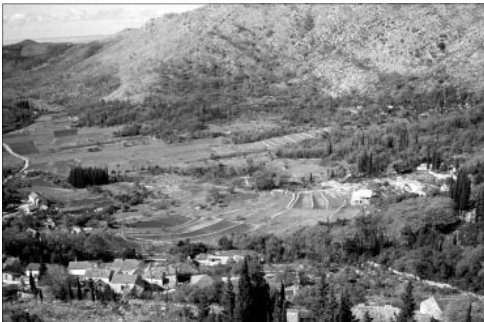
Photo 6: Ljubač karst field. Situated at a high altitude, Ljubač displays specific topography of a karst depression, with picturesque hamlets situated on the slopes and flat bottom of the valley. The fertile, arable field is surrounded by slopes overgrown with vegetation and adorned by steep escarpments and narrow, symmetrical terraces that once belonged to now abandoned vineyards (2001).

3. The third type is a karst field with arable land. The fields are situated in the zone of elongated valley depressions, with a road cutting through the middle, influencing the development and structure of the fields. Arable plots usually stretch perpendicularly towards the road, formed as a symmetrical rectangular network.