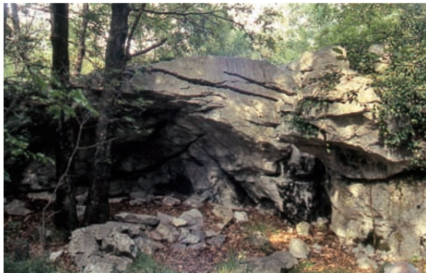
Fig. 3: Looking towards the surviving cave wall from the floor of an unroofed cave, Trieste Carso, Italy.