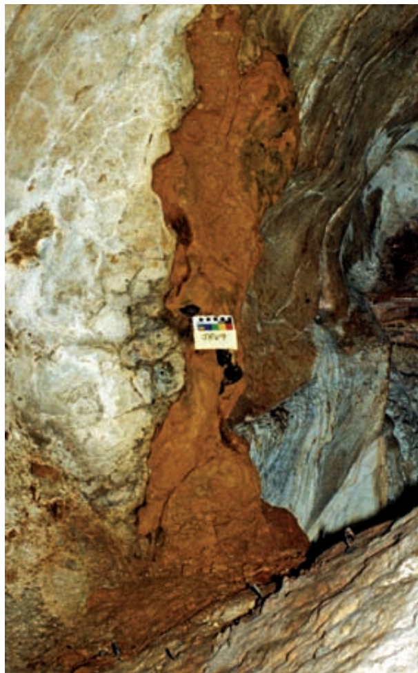
Fig. 1: Plastic illite-bearing clay, mustard yellow, in the River Cave, Jenolan Caves, NSW Australia. The < 2\mu\text{m} fraction of this clay was K-Ar dated by Osborne et al., (2006) at 357.30 \pm 7.06 Ma.

Despite many years of working on palaeokarst, I initially found the Early Carboniferous (340 Ma) K-Ar dates for unlithified clays in Jenolan Caves incredible (Figure 1).