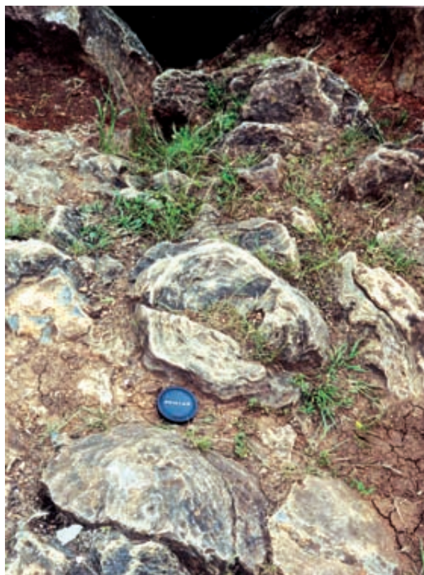
Fig. 2: Speleothem, exposed on surface above Dip Cave, Wee Jasper, NSW, Australia. Cave entrance can be seen top of photo. This speleothem has outlived all of the cave it formed in.

Some cave walls do fail for a variety of reasons. We can observe this in many breakdown chambers and it is possible to recognise the sources of the weakness in the walls that resulted in their failure.