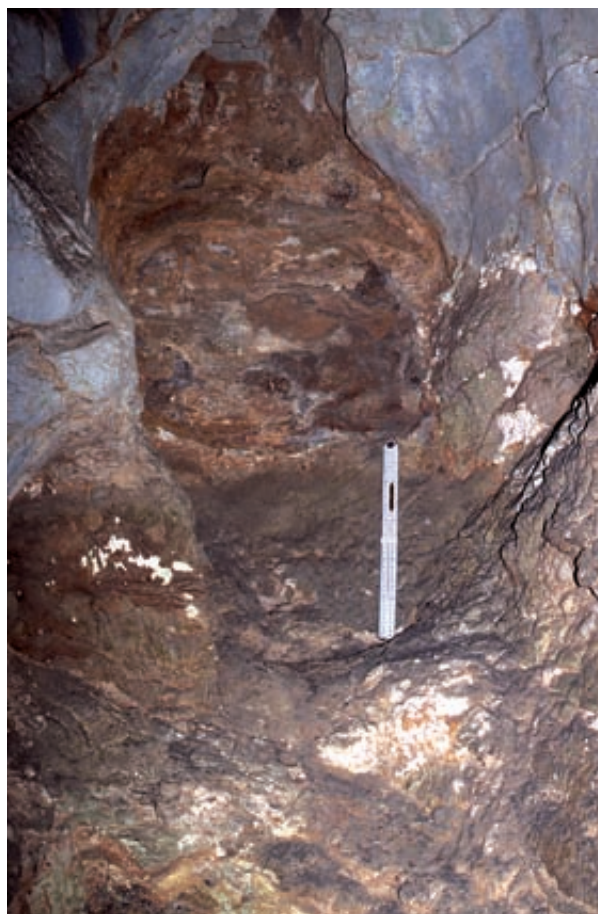
Fig. 5: Palaeokarst sandstone filling spar-lined tube intersected by more recent cave in the entrance area of Lucas Cave, Jenolan Caves, NSW, Australia. The strongly cemented sandstone is younger than the plastic clay shown in Figure 1.

then that while level in the landscape is a good indicator of the age of fluvial caves, it has little to do with the age