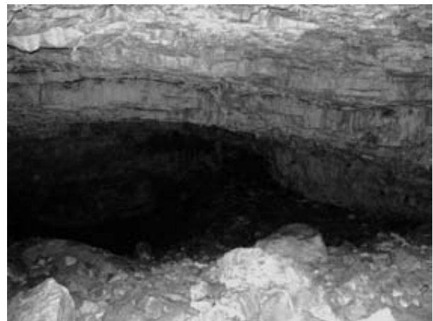
Fig. 2: The large chamber in the Arena cave. In the foreground the debris blocks, in the background the inner "doline".