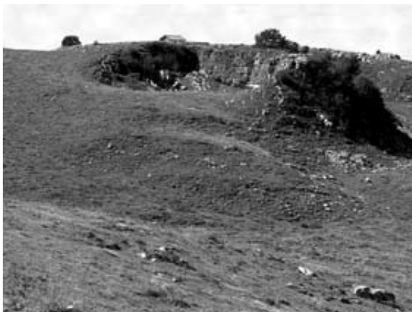
Fig. 1: The collapse depression called Arena.