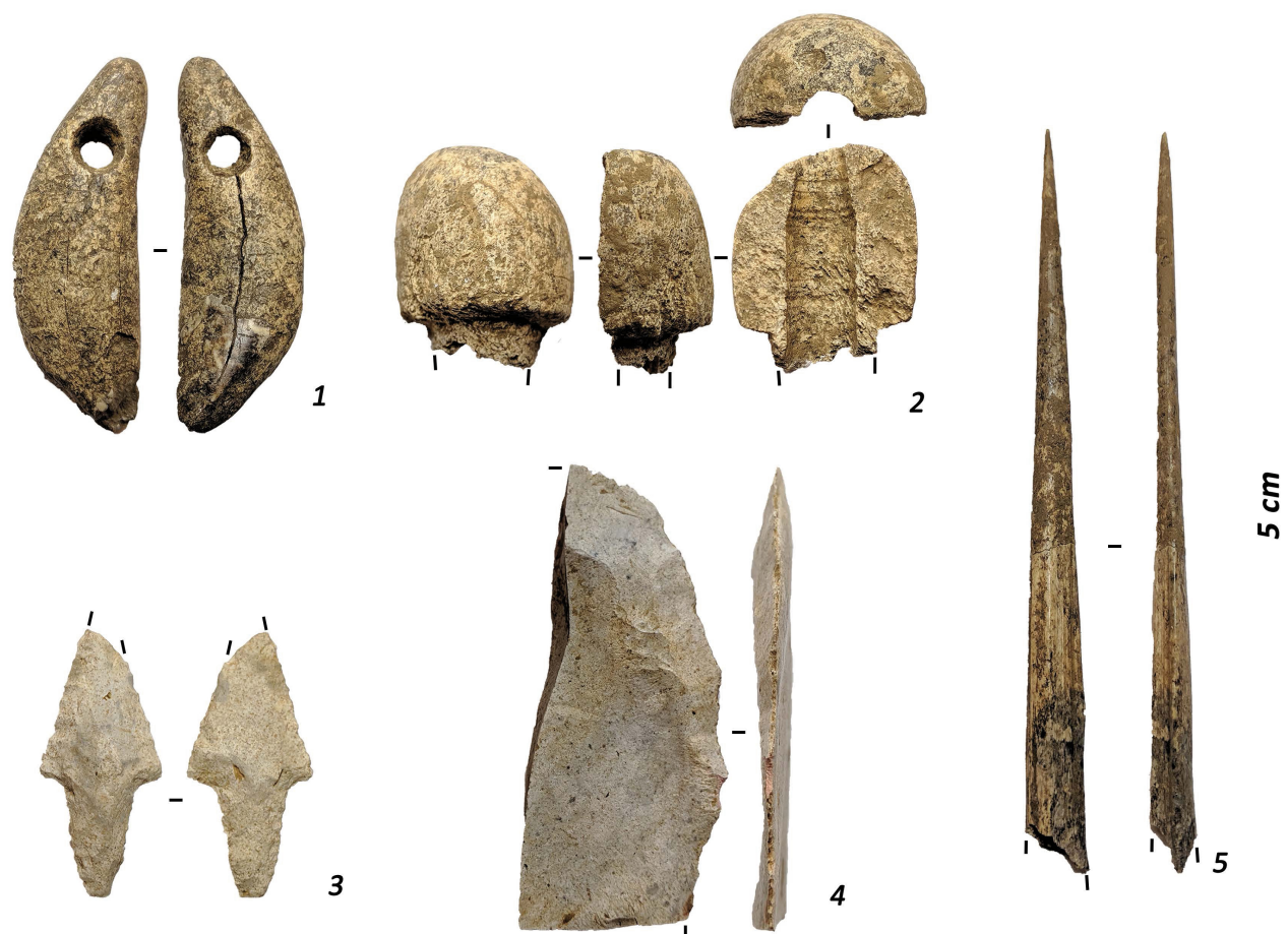
Fig. 2 – Archaeological evidence recovered 1999, 2016 and 2017.

1. Pierced carnivore tooth; 2. Bone object; 3. Tanged point; 4. Large flake with high gloss use wear; 5. Bone awl.