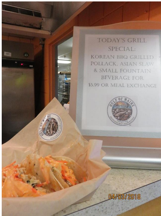
Figure 3 Korean BBQ Taco Test Entrée with Outreach Small Signage and Sticker

Within the spring study, we tested a new entrée made of pollock, an underutilized white fish from the Gulf of Maine that has the Gulf of Maine Responsibly Harvested ® eco-label designation. This entrée was served during lunch as a la carte, shown in Figure 3, and during dinner as part of the dormitory all-you-can-eat buffet. This new entrée was not popular for either of the meal shifts, with only 5% of those surveyed at lunch and 17% of those surveyed at dinner ordering the pollock tacos. For both lunch and dinner patrons, their top reasons for choosing the fish tacos focused on preference for seafood and eating healthfully, followed by the desire to eat locally and sustainably. Only a minority of lunch and dinner customers chose the tacos because they considered this entrée their best option among other main dishes. For the remaining participants, their top reason for not choosing the fish tacos was because they did not see this entrée being offered – 45% reported this as the top reason at lunch, and 26% at dinner. Secondary reasons included not liking seafood or preferring other options for that meal. The choice factors are summarized in Table 1.