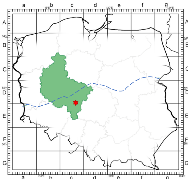
Fig. 1 Distribution of Hericium flagellum in Wielkopolska Voivodship (blue line – northern limit of the natural range of Abies alba in Poland [61]; green area – Wielkopolska Voivodship; red star – the “Olbina” nature reserve).

the description by Mirek et al. [36]. The nomenclature of plant communities was given according to Matuszkiewicz [32]. The collected specimens of H. flagellum were deposited in the Herbarium of the Department of Botany and Nature Conservation, University of Szczecin (SZUB). The occurrence of H. flagellum in Wielkopolska Voivodship is shown on the cartographic map (Fig. 1) according to the ATPOL grid square system as used by Wojewoda [37].