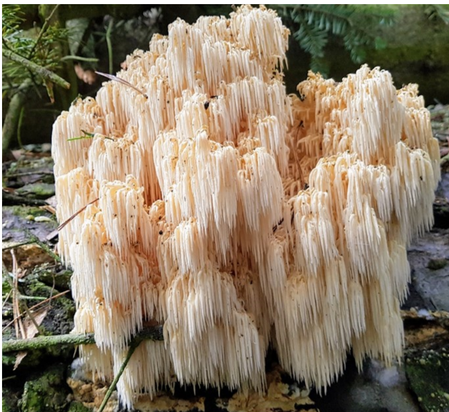
Fig. 2 Hericium flagellum basidioma growing on a fallen log of Abies alba in the “Olbina” nature reserve (November 9, 2017).

broadly ellipsoid, thick-walled, hyaline, amyloid, some containing oil droplets, almost smooth (under LM) to minutely verrucose (under SEM) (Fig. 3B–D), (5–)5.2–6.0(–6.6) × 4.4–5(–5.4) μm.