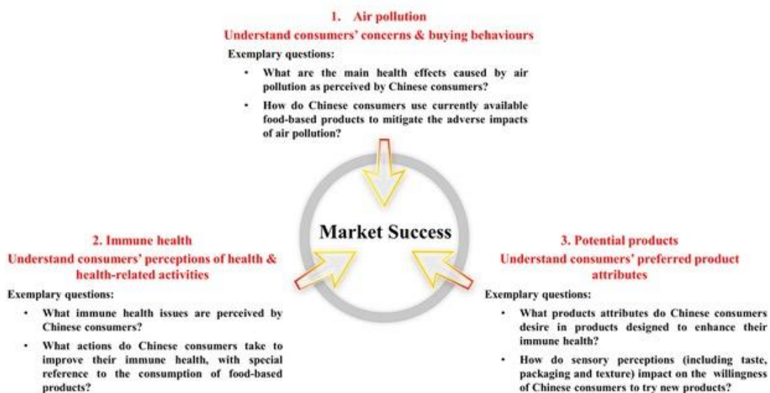
Figure 2. Road map for further research (with exemplary questions) to support the commercial success of functional food products designed to enhance the immune health of people facing persistent air pollution

A road map for further research to support the commercial success of functional food products designed to help the immune health of people facing persistent air pollution is shown in Figure 2 in which future research questions are summarised under the following three points: air pollution, immune health and potential products. Market success will require an integrated understanding of consumers’ perceptions of air pollution, health and related products.