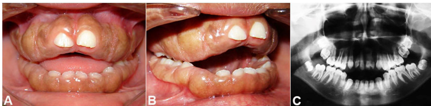
Figure 1. A and B - Intraoral clinical aspects of hereditary gingival fibromatosis. Note the severe and generalized gingival enlargement involving both the maxillary and mandibular arches. In some regions, the entire crown is covered by fibrous tissue, and in others, it covers almost two-thirds of the clinical crowns; C - Panoramic radiograph showing all permanent teeth present and normal development of the dentition.

Based on the combined clinical and morphologic findings, the diagnosis was hereditary gingival fibromatosis. The treatment plan consisted of surgical removal of the enlarged gingival tissue by the external bevel gingivectomy on the buccal and palatal-lingual surfaces of both arches under local anesthesia (Figure 3A). Non-steroidal anti-inflammatory was prescribed (Ibuprofen® Oral Suspension 100mg/5ml,