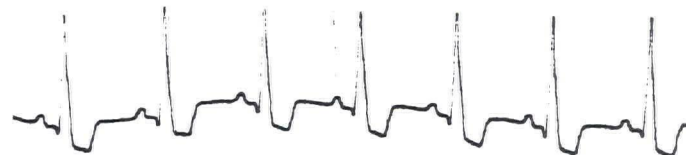
Fig 4—Restoration to normal sinus rhythm.

convert the arrhythmia using atrial overdrive pacing were unsuccessful. After the patient had received the diltiazem tablet, we were able to convert the tachydysrhythmia to normal sinus rhythm by employing the same pacing protocol. Although this case represents an isolated occurrence and the causal relationship has not yet been established, diltiazem in addition to overdrive pacing through chest temporary electrodes placed routinely at the time of surgery may be useful in the management of supraventricular tachydysrhythmia after coronary bypass surgery. It should be noted that therapeutic blood levels of the drug are reached in 30 to 45 minutes after oral administration. The incidence of side effects is relatively low. Randomized prospective studies are needed to determine whether calcium channel blockers with a negative chronotropic effect, such as diltiazem and verapamil, in addition to overdrive pacing, should be considered along with digoxin or beta-blockers in the management of supraventricular tachydysrhythmia occurring after coronary bypass surgery.