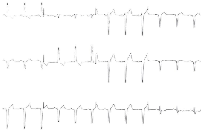
Fig 1—Electrocardiogram prior to the surgical procedure consistent with prior anterior wall myocardial infarction.