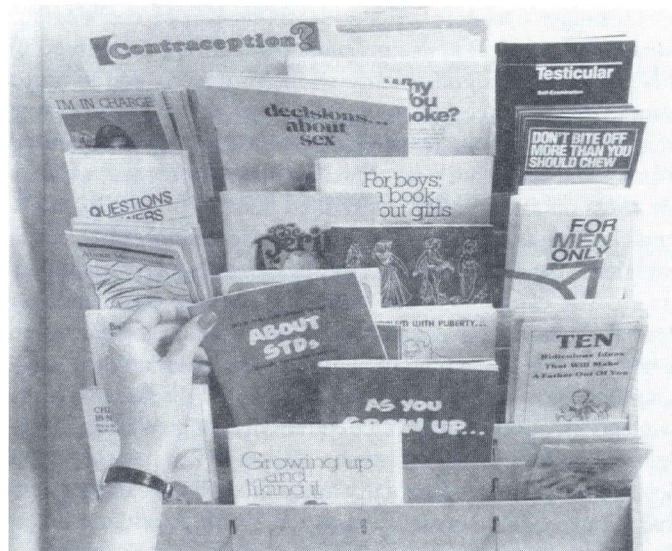
Fig 2—Display of various material available for patient review in the examining room.

While none of us is a formally trained specialist in adolescent health, we all share a deep commitment to this age group. We have assembled a small collection of books on various aspects of adolescent care which we keep in the clinic for easy reference (7-12). We have sought to improve our skills by attending conferences on adolescent health, reading appropriate publications, and consulting colleagues in other specialties as necessary, especially gynecology, orthopedics, dermatology, and psychology. Important resources include the meetings and publications of the American Academy of Pediatrics and the Society for Adolescent Medicine and the workshops on evaluation and treatment of sexually transmitted diseases sponsored by the Centers for