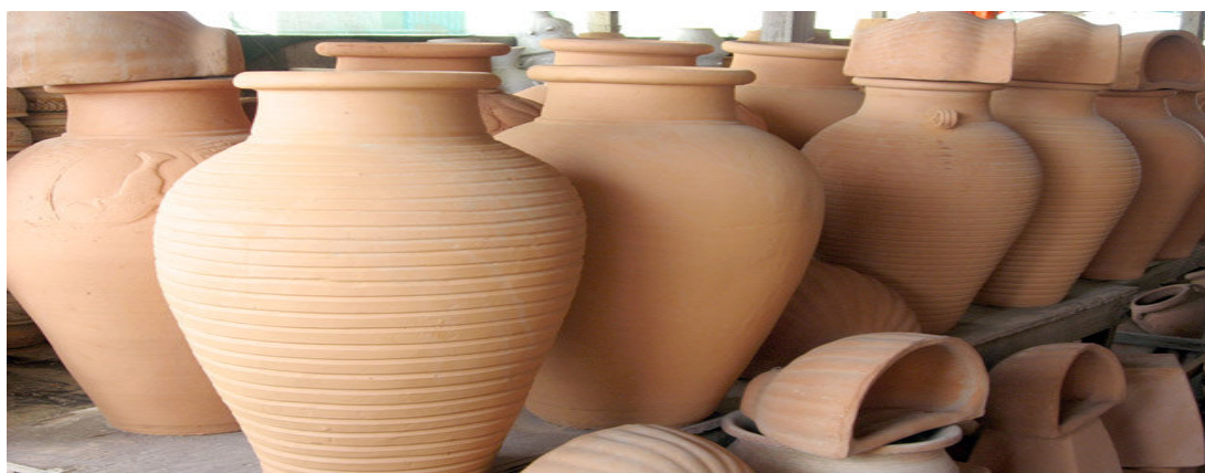
Figure No. 5, Pottery-making: UAE's oldest craft