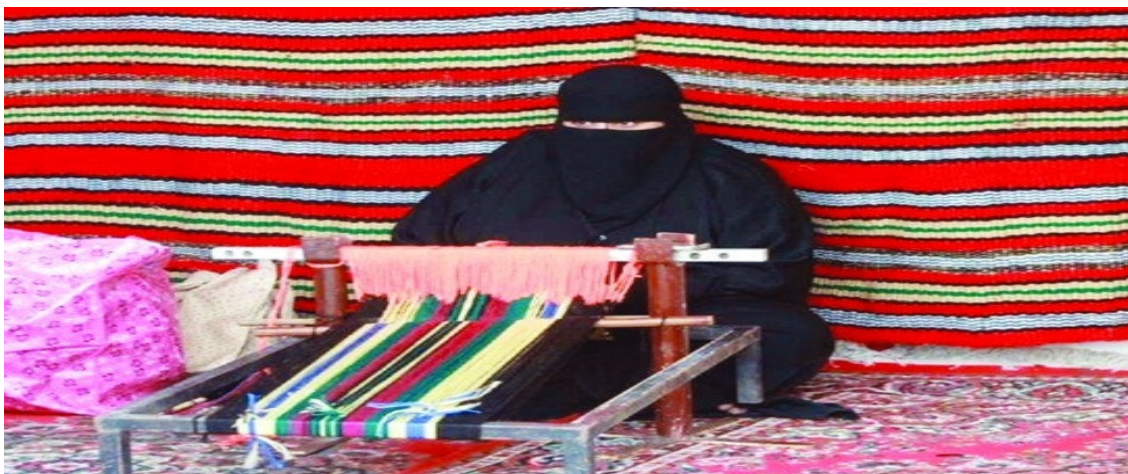
Figure No. 4, Al Sadu .... Traditional weaving skills in the United Arab Emirates