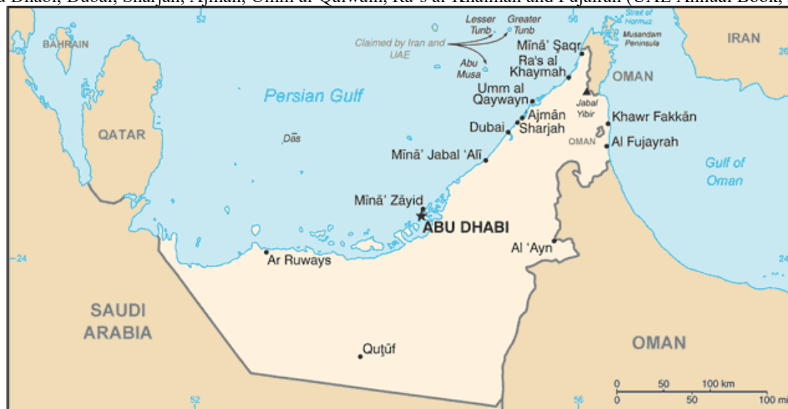
Figure No. 2, the United Arab Emirates' Geographical Location

The United Arab Emirates is located in south-west Asia, in the east of the Arabian Peninsula, bordered on the north and northwest by the waters of the Arabian Gulf and to the east by the Indian Ocean. The country shares a maritime border with Qatar on the northwest, while there are land borders with Saudi Arabia in the south and west and with the Sultanate of Oman in the southeast. The federation of the UAE has seven member emirates, Abu Dhabi, Dubai, Sharjah, Ajman, Umm al-Qaiwain, Ra's al-Khaimah and Fujairah (UAE Annual Book, 2016).