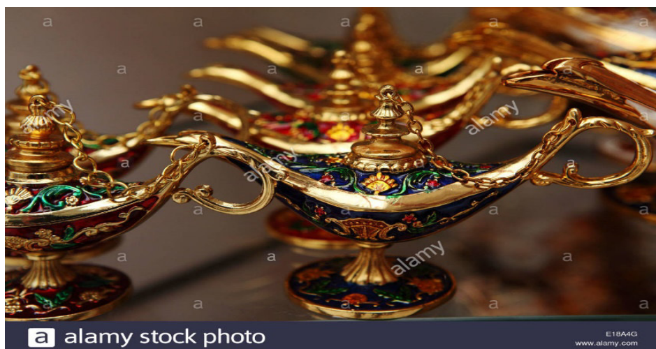
Figure No. 9, Arabian lamp souvenirs in Abu Dhabi -- Image ID: E18A4G