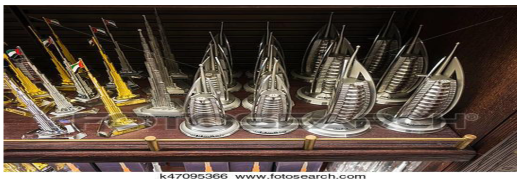
Figure No. 8, UAE Souvenirs at the duty free airport of Dubai