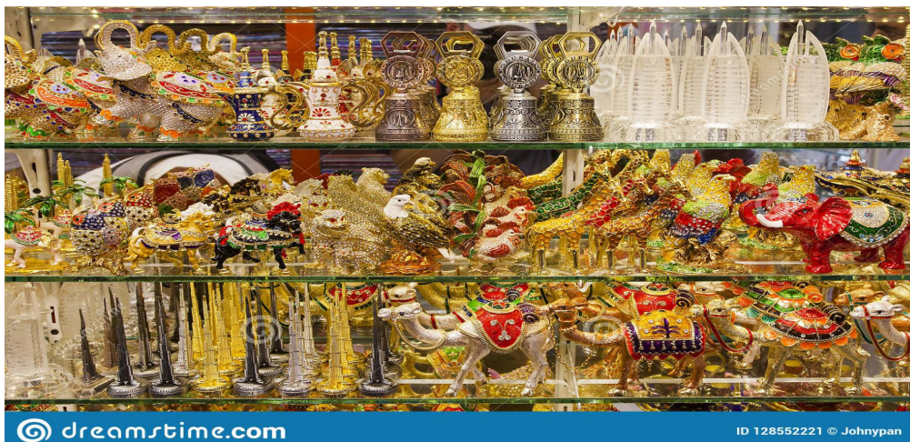
Figure No. 7, DUBAI, UAE - SEPTEMBER 29 2018: traditional Arabic souvenirs for sale in Dubai souk market.