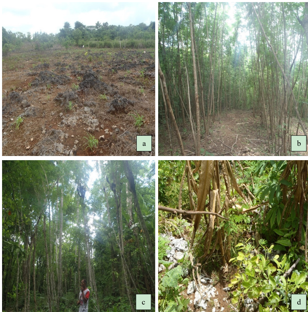
Figure 2. Overview of the land condition (a); Amarasi plantation (b); Mamar Kering plantation (c); and Seloboa plantation (d)