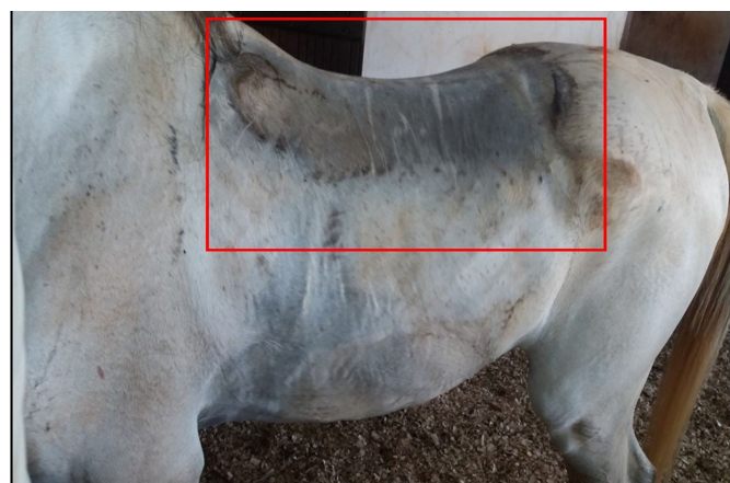
Figure 2 – Sweaty horse after being exercised with the Western saddle; however, showing a homogeneous sweat mark (within the red square).