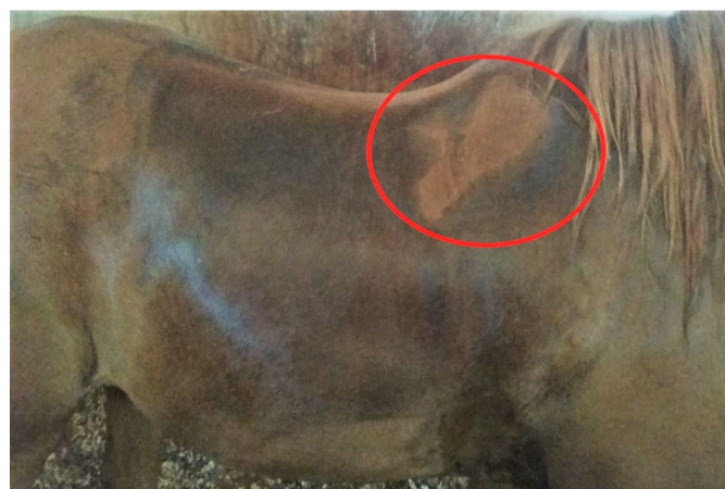
Figure 1 – Sweaty horse after exercise; however, showing a lack of sweat mark in the withers area (inside the red circle).

When the panel temperatures of both saddles were analyzed, a difference of more than 6°C was observed