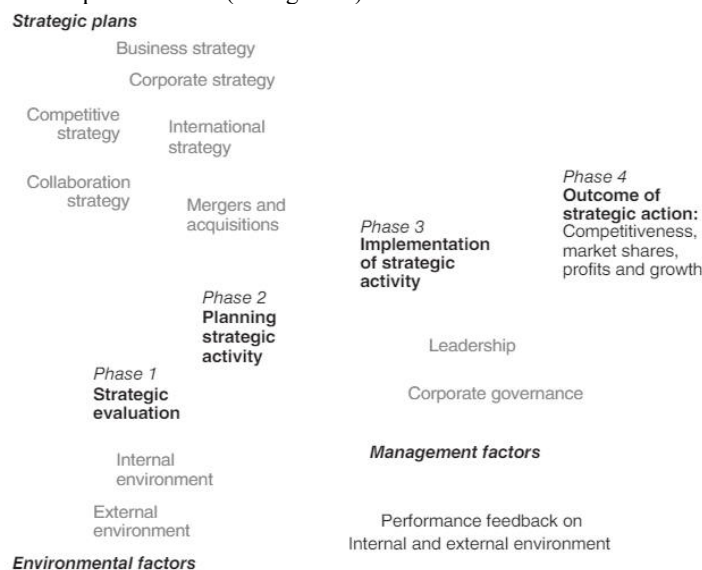
Fig 1: Components of strategic management

Outcome of the strategic action after executing and evaluating the process, management should look at the outcome if it meets the expected results (Zhang 2009).