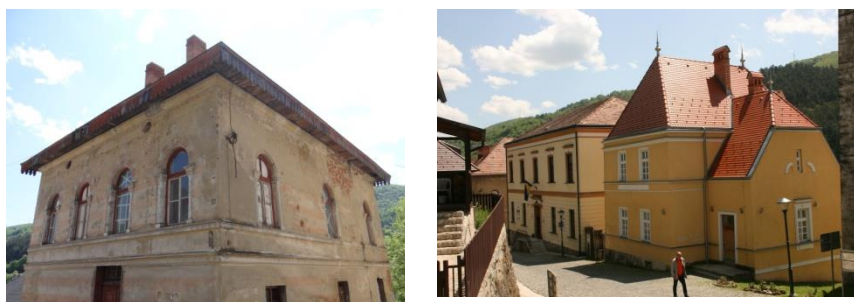
Fig. 2. Left: The Sarač House in Jajce, May 2019 (Foto: Bajramovic) Right: The Austro-Hungarian ensemble at Jajce with Sarač House, Old Primary School and Finance Building in May 2019 (Foto: Jaeger-Klein)

For educational structures of the humanities, during the time when the canonical Historicism of the 1870s and 1880s was at its peak, the Neo-Renaissance style was considered as the most adequate answer for the building task. A slight Bosnian twist on this style was hidden within the color scheme of yellow and red, although the decoration of the school building cannot be classified as a part of the Orientalizing style of Bosnia. The functional space placement of the Old Primary School building follows the type planning models exhibited at the Viennese World Exposition of 1873. The number of windows indicates that it contained four classrooms, one for each class, all orientated towards the south. The teacher's residence, the necessary administration, and other functional rooms were all placed in the north. The staircase is located at the north-western corner. Today, the building serves as a local National museum, housing a permanent exhibition of ethnographic as well as petrographic specimens.