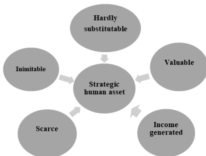
Figure 1. Strategic Human Assets