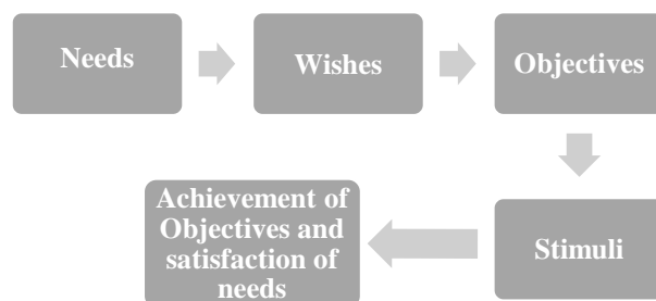
Figure 3. Motivation Process

According to Raineri (2017) approach, a person's behaviour is composed of motives (likes, preferences, needs, values); abilities (physical and mental skills) and knowledge (education and skills). The support of the environment, provided by the organization, is composed by information about strategies, objectives and current performance; instruments (tools, techniques, technology, work method); and incentives (monetary and non-monetary). Therefore, in the sense of causality, motivation consists fundamentally of maintaining corporate cultures and values that lead to high performance (Armstrong and Taylor, 2014). This process is presented in figure 3.