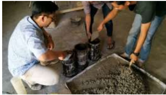
Figure 4. The process of making concrete cylinder samples with Anadara granosa shell powder as a substitute for cement

Anadara granosa shell powder is added by reducing the amount of cement in the mixture. Anadara granosa shell powder was added at levels 3%, 5% and 7%. When the concrete sample is 28 days old as shown in Figure 5, a compressive strength test is performed using the Compression Testing Machine (CTM). The testing process as shown in Figure 6. Recapitulation of compressive strength test results as shown in Table 3 and graphs in Figure 7 The compressive strength test results showed that the optimum compressive strength value of concrete with Anadara granosa powder as a substitute for cement was at the level of 3% of shell powder.