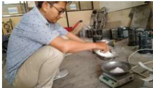
Figure 2. Weighing the Anadara granosa shell powder

In this study, shell waste powder was substituted with cement using a ratio of the weight of cement in the mixture. The level of Anadara granosa shell waste powder used was at 3%, 5%, and & 7% of the weight of cement in the concrete mixture. The Anadara granosa shell powder used was weighed according to the mix design, as shown in Figure 2 before being mixed in the concrete.