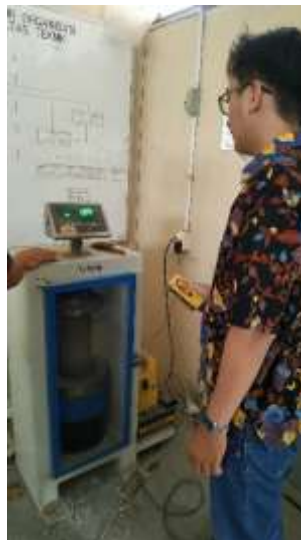
Figure 6. The process of compressive strength testing of concrete with the substitution of Andara granosa powder instead of cement