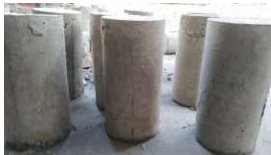
Figure 5. Concrete cylinder samples with the substitution of Anadara granosa powder instead of cement

Anadara granosa shell powder is added by reducing the amount of cement in the mixture. Anadara granosa shell powder was added at levels 3%, 5% and 7%. When the concrete sample is 28 days old as shown in Figure 5, a compressive strength test is performed using the Compression Testing Machine (CTM). The testing process as shown in Figure 6. Recapitulation of compressive strength test results as shown in Table 3 and graphs in Figure 7 The compressive strength test results showed that the optimum compressive strength value of concrete with Anadara granosa powder as a substitute for cement was at the level of 3% of shell powder.