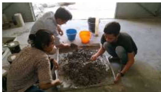
Figure 3. The process of making concrete with the substitution of Anadara granosa powder as a substitute for cement