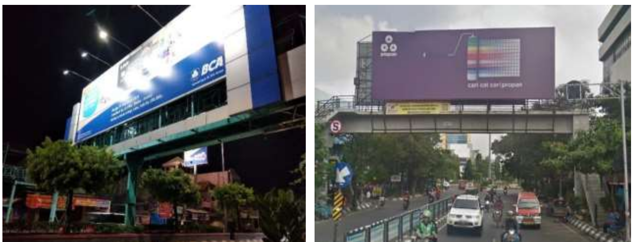
Figure 2. The visual of the pedestrian bridge at Sugiyapranoto Street and Ahmad Yani Street