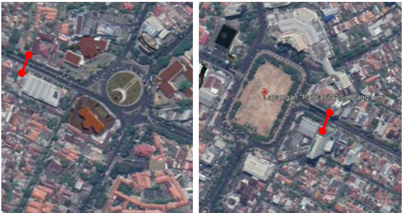
Figure 1. The location of the pedestrian bridge at Sugiyapranoto Street and Ahmad Yani Street

The study conducted along the corridor Jl. Ahmad Yani, Jl. and Jl. Mgr Sugiyopranoto, Semarang city. The reason the author chose this location is that along the corridor, and the road is a commercial zone with a lot of people ( Figure 1 ).