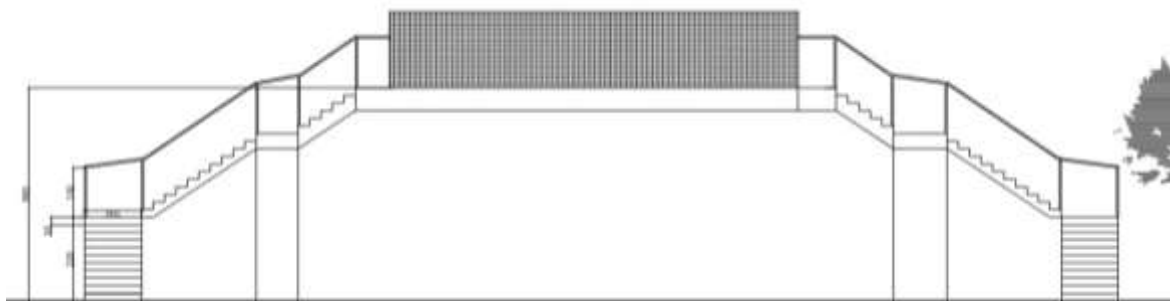
Figure 4. Elevation of the pedestrian bridge at Ahmad Yani Street