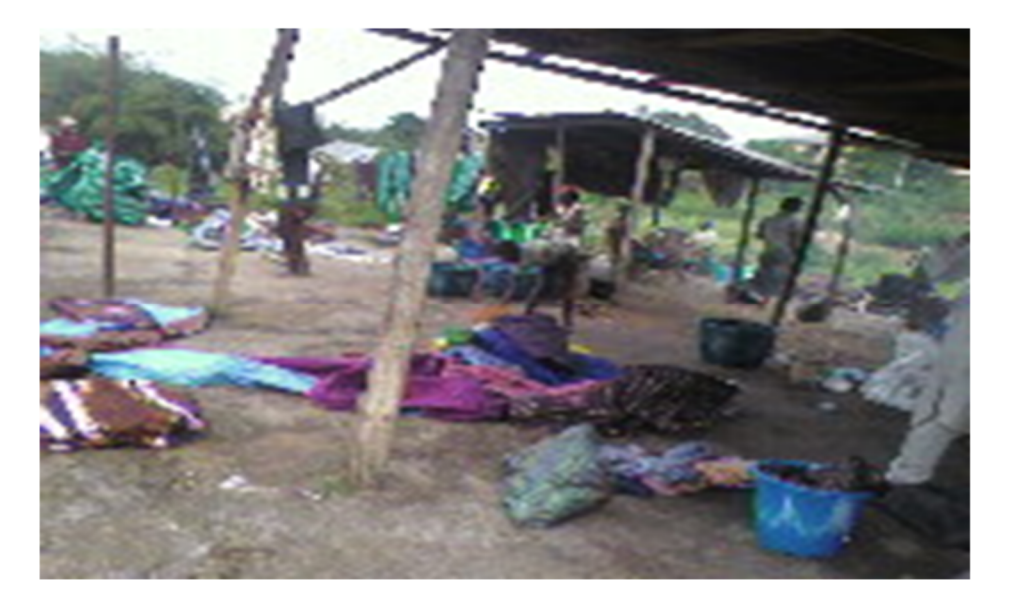
Fig. 1. Local tie and dye industry in Campala Market, Abeokuta. Nigeria

The treatment performance in particular, the design transfer characteristics and adsorption properties of CW depend to a great extent on the physical and chemical characteristics of the substrates. Very small particles have very low hydraulic conductivity which encourages surfacing (a situation in which a portion of the wastewater flows on top of the substrate) whereas very large gravels have high conductivity but lack the good wetted surface area per unit volume suitable for microbial habitat and growth. Sand or gravel is favoured as CW substrate because of the greater surface area available to the microorganisms, and the ease and uniformity with which the effluent can flow through sand or gravel (Kadlec and Knight, 1996).