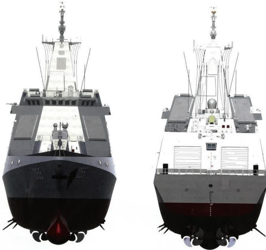
Image 10. Bow and stern views of the Type 055 reveal the large S-band planar arrays. The twin hangar doors also may be indicative of the PLAN’s new appreciation for the importance of shipborne helicopters for surface combatant operations.

Deploying such a large warship in the Indian Ocean and to ports in Africa on ‘friendship tours’ could help promote Chinese political objectives. The fact that the Indian Navy does not have an equivalent warship to the Type 055 would be quickly evident to astute observers any time the new Chinese cruisers make an appearance in the Indian Ocean. Likewise, the Chinese cruiser could be very useful in showing the Chinese flag in places further afield, such as South Africa and potentially even into the Atlantic. Such long-range sorties would be in keeping with Beijing’s new policy of extending its influence to regions outside of the Indo-Pacific in which the Chinese government has interests. As Peking University maritime strategist Hu Bo relates in a new book: “The Chinese Navy needs to demonstrate its strength at the right place at the right time” in order to “exert more influence” across “other global maritime regions.” 136