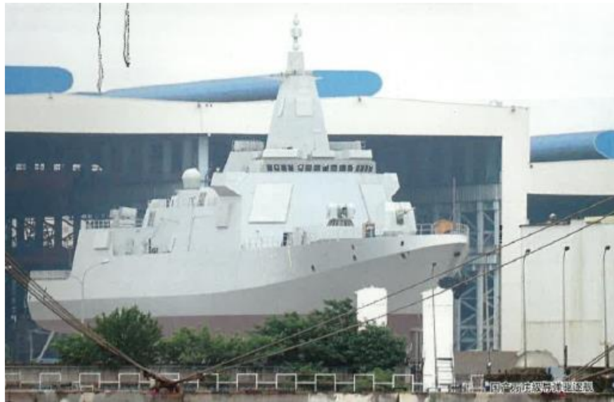
Image 2. The Type 055 is being built simultaneously at shipyards in Shanghai and Dalian. The rate of fabrication is noteworthy, given that eight vessels are either complete or in build.

Evidently quite aware of significant turmoil in U.S. surface warship building plans, Chinese naval architects set out on an ambitious project. 17 At the end of 2009, the Type 055 project received official approval and fabrication of the initial prototype began at the new Jiangnan shipyard outside Shanghai in 2014. 18 Early in that same year, a distinctive 1:1 scale model of the superstructure of a new large surface combatant “appeared suddenly” in Wuhan—a somewhat shocking development since the Type 052D had just made its debut. This apparently reflects the PLAN’s approach to warship design, i.e., to simultaneously “fit out a generation, build a generation, and design a generation” (装备一代，生产一代，预研一代). 19