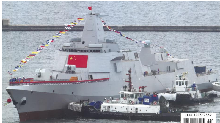
Image 1. The Type 055 cruiser is significantly larger than its predecessors and reveals a new confidence in Chinese warship design.

With a displacement exceeding 12,000 tons, Type 055 is nearly double the tonnage of its Chinese destroyer predecessor and 23 meters longer. 7 In an age when naval strategists had generally considered large surface combatants to be excessively vulnerable to torpedoes and anti-ship cruise missiles, the Chinese Navy appears to be turning conventional wisdom on its head. Instead, Chinese strategists assert that a close reading of recent naval history reveals the advantage of “going large” (大型化) when it comes to warship design. 8 The program amounts to a bold assertion that China intends to wield a large and capable fleet across the world’s oceans. In a military sense, this assertion also indicates a certain faith prevailing in Beijing that China has mastered the requisite technologies to guard such prized capital ships. For naval strategists, therefore, the commissioning of the first Type 055 in January 2020 may represent a Dreadnought (1906) or even Bismarck (1939) type moment. 9 The launching of these two famous ships dramatically altered the naval strategy landscape in their day. The same might well be said a few decades hence regarding the advent of Type 055.