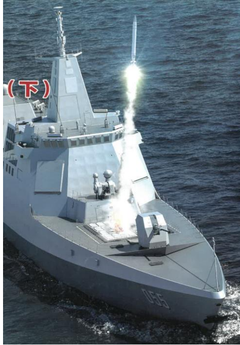
Image 7. A graphic image portrays the launch of a YJ-18 ASCM, a lethal missile based on the Russian SSN-27. The cruiser boasts a large magazine of 112 VLS cells. In addition to strong air and missile defense armament, therefore, the vessel is also a potent strike platform.

The forward deck gun is an improved 130 millimeter single-barreled H/PJ-38. It is also found on Type 052D and can fire 40 shells a minute out to a trajectory of 30 km. 74