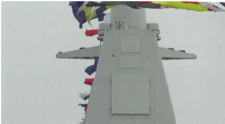
Image 4. The integrated mast of the Type 055 cruiser increases stealth and also incorporate an X-band radar. In combination with S-band planar arrays, the dual band radar sensor system could be on par with the most advanced U.S. shipboard tracking systems.

For anti-submarine warfare (ASW) sensors, this vessel has both a bow-mounted sonar and a towed array system. It can also accommodate a pair of ASW helicopters. 44