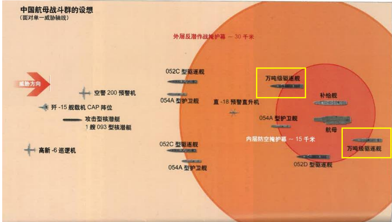
Image 8: This notional sketch of a Chinese aircraft carrier battle group features two Type 055 cruisers (designated by yellow squares inserted by authors) in close proximity to the Chinese carrier. This graphic may imply that the most important mission of the new Chinese cruiser is actually air and missile defense for the PLAN’s new carrier groups.

weapon conflict.” 113 There is evidence, moreover, that Chinese naval analysts are studying American doctrine on this subject, including such delineations as the “fighter engagement zone” (FEZ), the “joint engagement zone” (JEZ) and “missile engagement zone” (MEZ). 114