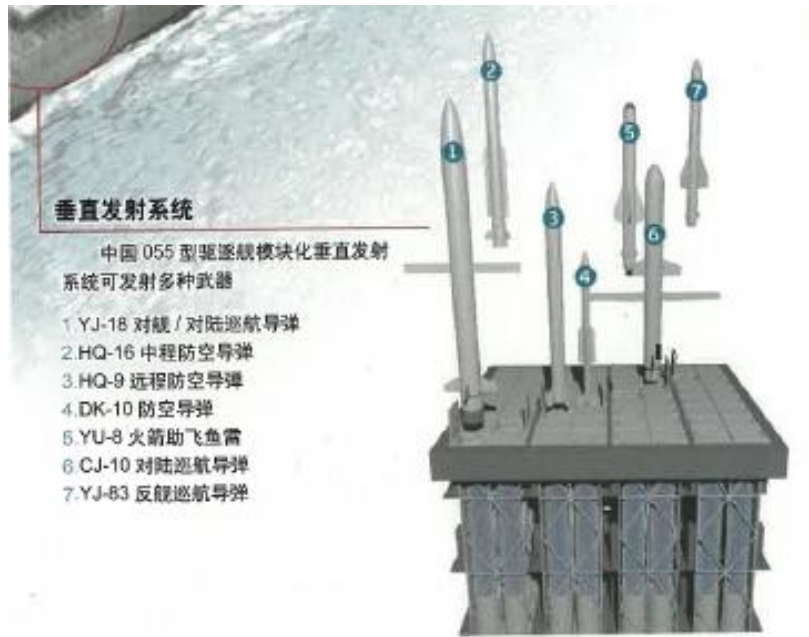
Image 6. This graphic illustrates seven different missile types compatible with the vertical launch system (VLS) aboard the Type 055. These include two types of anti-ship cruise missiles, three types of anti-air missiles, an anti-submarine rocket-torpedo system, as well as a land-attack cruise missile.

The universal VLS for Type 055 might well be larger and more advanced, with a width of .85m (2'9") and a depth of 9m (29'6") per cell. 54 It incorporates surface to air missiles (SAM), anti-submarine rocket (ASROC), land attack cruise missiles (LACM), anti-ballistic missile (ABM) interceptors and advanced anti-ship cruise missiles (ASCM). 55 It possesses a total of 112 VLS cells, 64 forward and 48 aft. The large number of VLS cells "shows the combat and rapid-reaction capability" of the new ship, according to military expert Song Zhongping. "Since recharging a VLS is relatively difficult, the more VLS cells a vessel takes, the stronger and quicker its reaction," he said. 56 Chinese analyses show a keen awareness that "the consumption of ship-to-air missiles in an actual engagement is very large" (实际交战中舰空导弹的消耗量是非常巨大的), and this recognition could have influenced the decision to equip the 055 with a very large missile magazine. 57