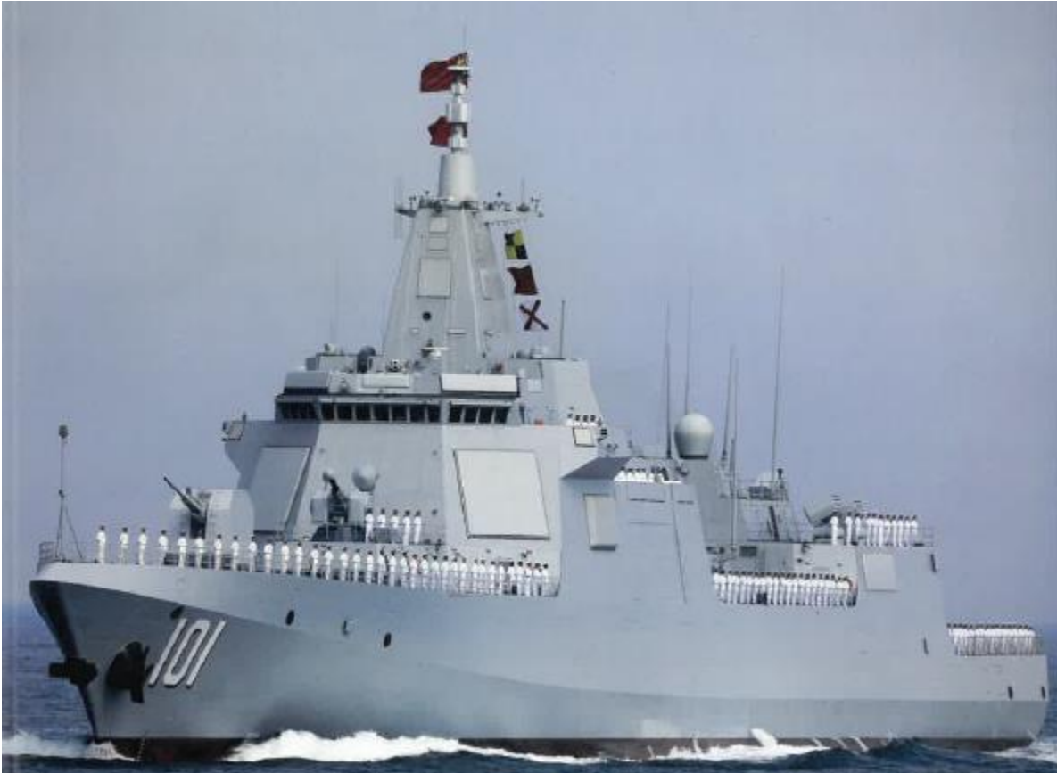
Image 11. The PLAN's first Type 055 cruiser Nanchang on parade. Along with the aircraft carriers, these capable warships are symbolic of China's ambition to wield a global navy.

that the U.S. Navy last engaged in high-intensity fleet-on-fleet combat involving submarines, it will be helpful to approach these vexing strategy questions with a decent amount of humility.