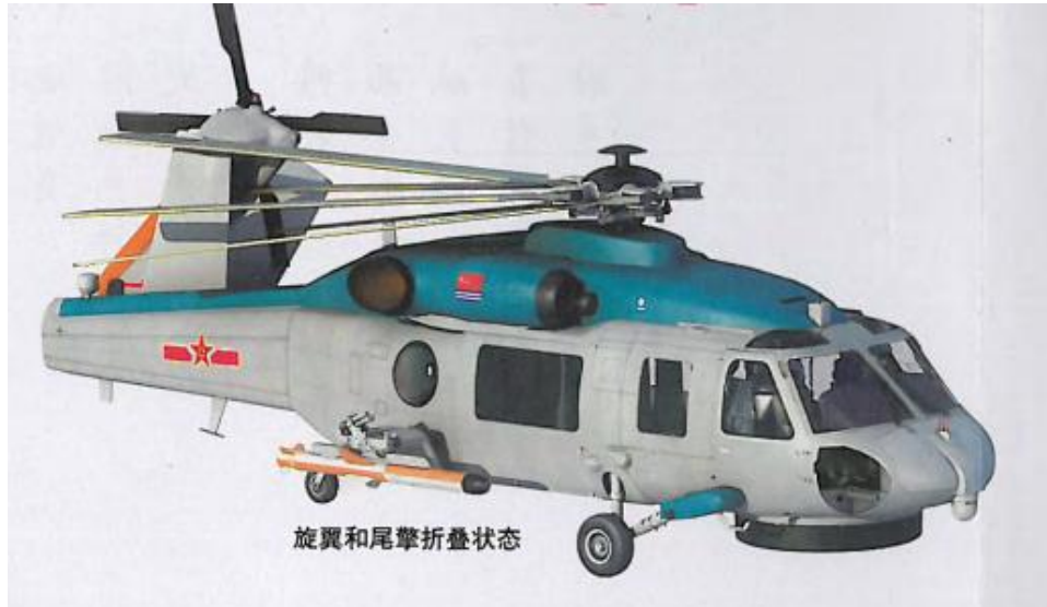
Image 9. This is a graphic depiction of China’s new Z-20 shipborne helicopter – a rather close copy of the highly effective American SH-60. Shipborne helicopters have long been a weakness for the PLAN and it has relied on the Russian-imported Ka-28. However, the Z-20, along with the larger Z-18, could substantially improve the Chinese Navy’s capabilities in this crucial domain.

destroyer will be easily attacked by submarines have no basis at all” (美国媒体称中国新型驱逐舰易遭潜艇攻击并没有足够的依据). 116