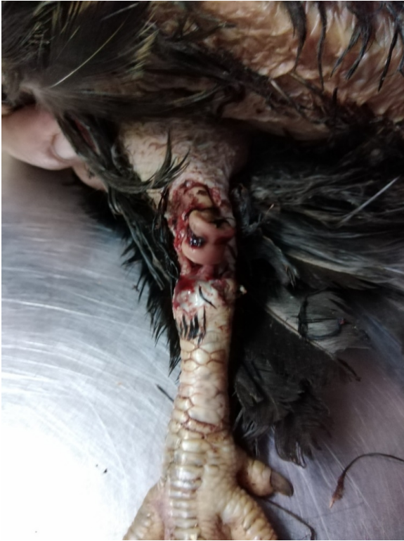
Fig. 1. The lacerated wound at tibiometatarsal joint