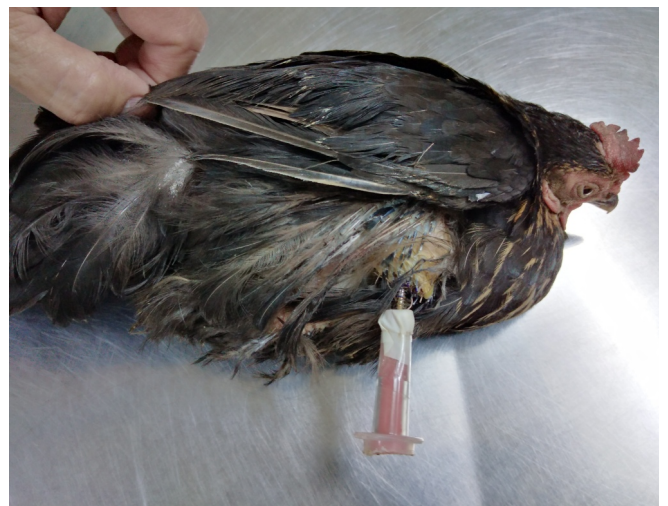
Fig. 4. Acrylic and some part of endotracheal tube as an exoprosthesis leg part was remodeled with screw's stump (endoprosthesis leg part)

Two cm outside from screw's stump was remodeled to exoprosthesis limb part by using acrylic and endotracheal tube (Fig. 4, Fig. 5).