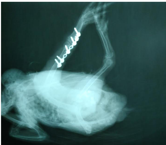
Fig. 2. Radiography showed 2.0 titanium maxillofacial plate was used for repair tibiometatarsal joint complete luxation