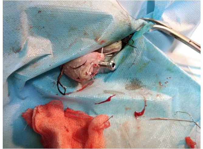
Fig. 3. Screw's stump as an endoprosthesis tibia leg part

A chicken was anesthetized with 4 % isoflurane by anesthetic mask. The skin, gastrocnemius muscle, and peroneus longus muscle were incised around the tibia until to found middle tibia. The tibia was transverse osteotomy at the site of middle tibia by oscillating saw. 3.0 mm stainless steel cortical screw with 4 cm in length was inserted to the residuum tibia until to proximal tibia but not penetrated to stifle joint. The muscles and skin were sutured by 3/0 chromic catgut and 3/0 nylon, consecutively, 2 cm of screw outside from the skin was screw's residuum for screw's stump (Fig. 3). The screw's stump was dressed every day until 10 days, the nylon sutures were removed from the stump.