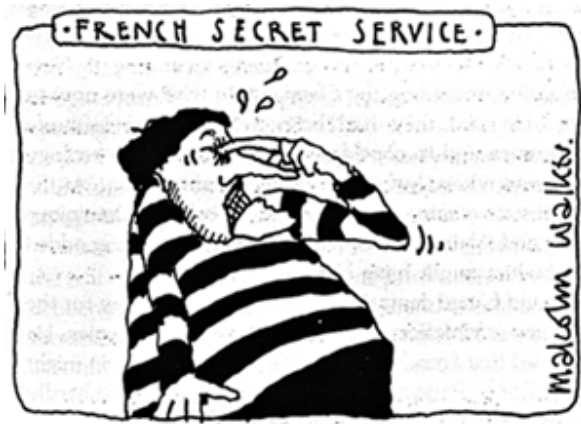
Cartoon: MALCOLM WALKER/Eyes of Fire

Meanwhile, the French Government denounced the sabotage and strongly denied any involvement. French press reports claimed the saboteurs were South African mercenaries, white New Caledonian anti-independence extremists or British agents -- anything to divert attention away from French involvement.