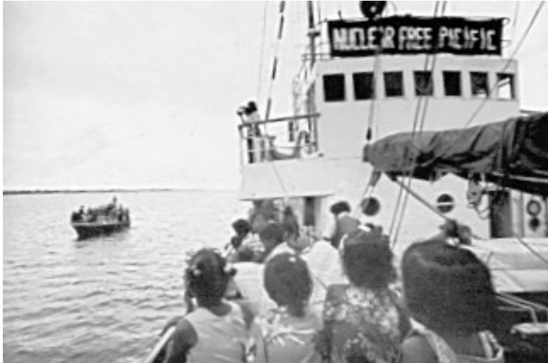
Photo of Rongelap Islanders leaving their atoll on board the Rainbow Warrior.

disaster of American atmospheric tests of the 1950s-- the 15-megaton Bravo H-bomb on Bikini Atoll, on 1 March 1954.