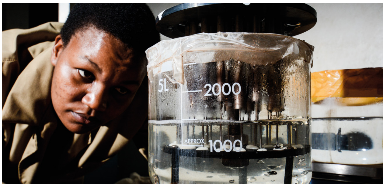
Researchers screened beans that cook faster and selected 12 for production

A gender responsive seed credit model allowing fair access to quality bean seed whenever required, coupled with collective marketing and the promotion of farming as a family business, will create even greater benefits to women farmers and their households. For collective marketing to become a sustainable practice and to maintain harmony within households, more men should be encouraged to join groups, promote bean growing as a family business, and support intra-household cooperation and sharing of responsibilities among men and women. Additionally, there is a need to sensitize men and women farmers to the important roles women can play in a household if they are given the opportunity and empowered economically.