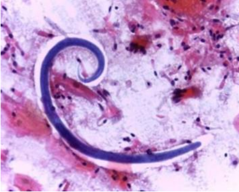
Figure 2. H&E stain on a bronchoalveolar lavage specimen showing a Strongyloides stercoralis filariform larva (100X).