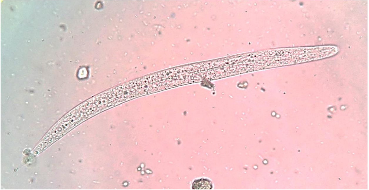
Figure 3. Wet mount of stool stained with methylene blue showing a Strongyloides stercoralis rhabditiform larva (100X). Rhabditoid esophagus can be appreciated.