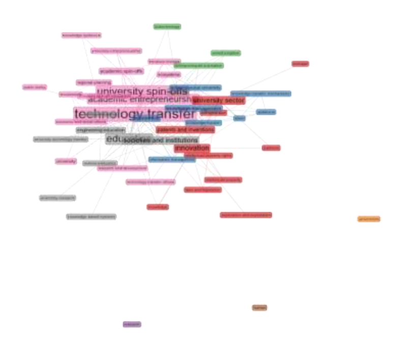
Figure 1. Topics of research on the spin off and university

In Italy the number of spin-offs still appears to be still limited compared to the potential held in universities scattered throughout the peninsula (Iacobucci & Micozzi, 2015). This is because the whole system is still relatively new and little used by the operators in the sector and, moreover, in order to observe the results of the efforts made in creating a spin-off, waiting times are quite long and difficult to analyze for the singularity of each spin-off. Especially when you observe the time necessary for a new company of this type to be able to detach itself from its mother university and become independent, or how long it takes the young company to get investments and have its own capital and available means, the precise estimate is difficult (Colletti G., 2018).