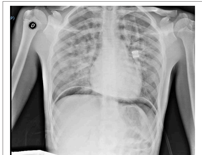
FIGURE 1 | Chest x-ray at clinical onset of symptoms, consistent with diffuse alveolar hemorrhage (DAH). There can be observed infiltrative opacification pattern mainly seen in the mid zones with apical sparing suggestive for impaired pulmonary microcirculation. There can be noticed areas of subdiaphragmatic air due to laparoscopy.

1 https://www.asahq.org/standards-and-guidelines/asa-physical-status-classification-system