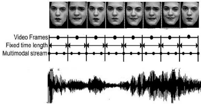
Fig 5. Bi-modal Input Processing