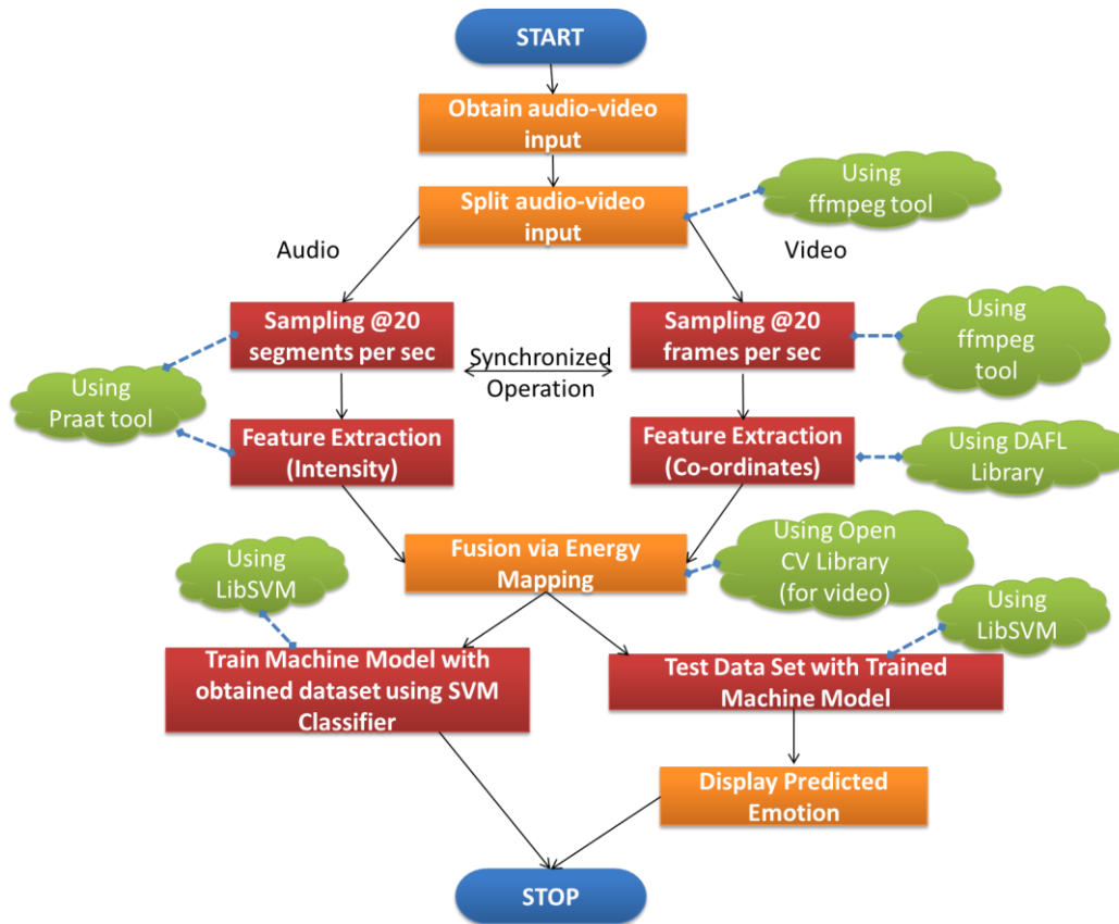
Fig 2. Architectural Framework of Bimodal Energy Based Fusion Model