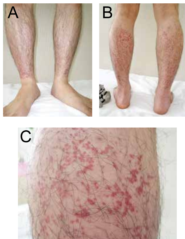
Figure 1. A : Images of palpable purpuric eruptions on the lower extremities (A : front, B: back, C : close image of a purpuric eruption)

122/68 mmHg, pulse, 98 per minute, and body temperature, 37.8°C. Blood examination indicated systemic inflammation with elevated white blood cells, 11900/μL and fibrinogen, 490 mg/dL, with a positive test for anti-streptolysin O antibody,