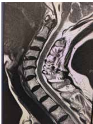
Figure 4 MR images of cervical spine show no presence of spinal cord compression.