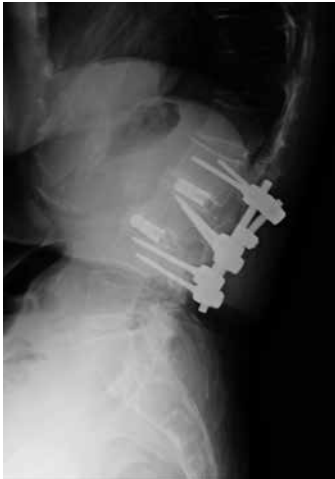
Figure 2 Plain lateral radiograph after posterior lumbar interbody fusion.

block of right C6. The patient subsequently underwent a right C5-C6 micro-endoscopic foraminotomy (Fig.6). Thereafter, pain around her right scapula disappeared in relatively early, and winged scapula almost improved in 6 months after surgery (Fig.7). The clinical results would be satisfactory.