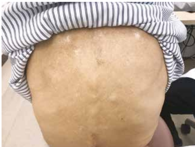
Figure 7 Improvement of winged scapula about 6 months after surgery.