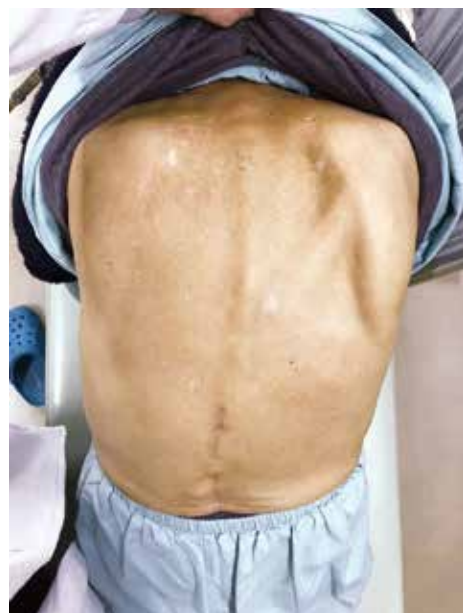
Figure 1 Medial scapular winging due to serratus anterior palsy.

posterior decompression and fusion surgery at local hospital (Fig.2, 3). Although, those symptoms partially improved, pain around her right scapula did not disappear. She was referred to our department for further examination and treatment in 2017. Physical examination revealed positive of the Jackson neck compression test and Spurling neck compression test. Except for the serratus anterior muscle, any other muscle weakness of the upper limb was not observed. All deep tendon reflexes were intact and no sensory deficit were observed. There were no symptoms attributable to cord compression. Parasagittal image of the MRI of the cervical spine showed no presence of spinal cord compression (Fig4). CT Scanning in the oblique axial planes and the oblique sagittal planes showed right foraminal stenosis at C5-C6